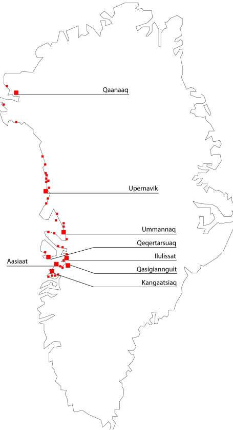
Locations of settlements and cities in Qaasuitsup Municipality

Upernavik district ranges from 71° to 74° latitude and encompasses 200,000 km 2 , an area slightly smaller than Great Britain. The hunting area encompasses most of the Melville Bay. The area has a high arctic climate with midnight sun lasting from mid-May to mid-August. A period of darkness lasts from early November to early February in the southern areas of the district.