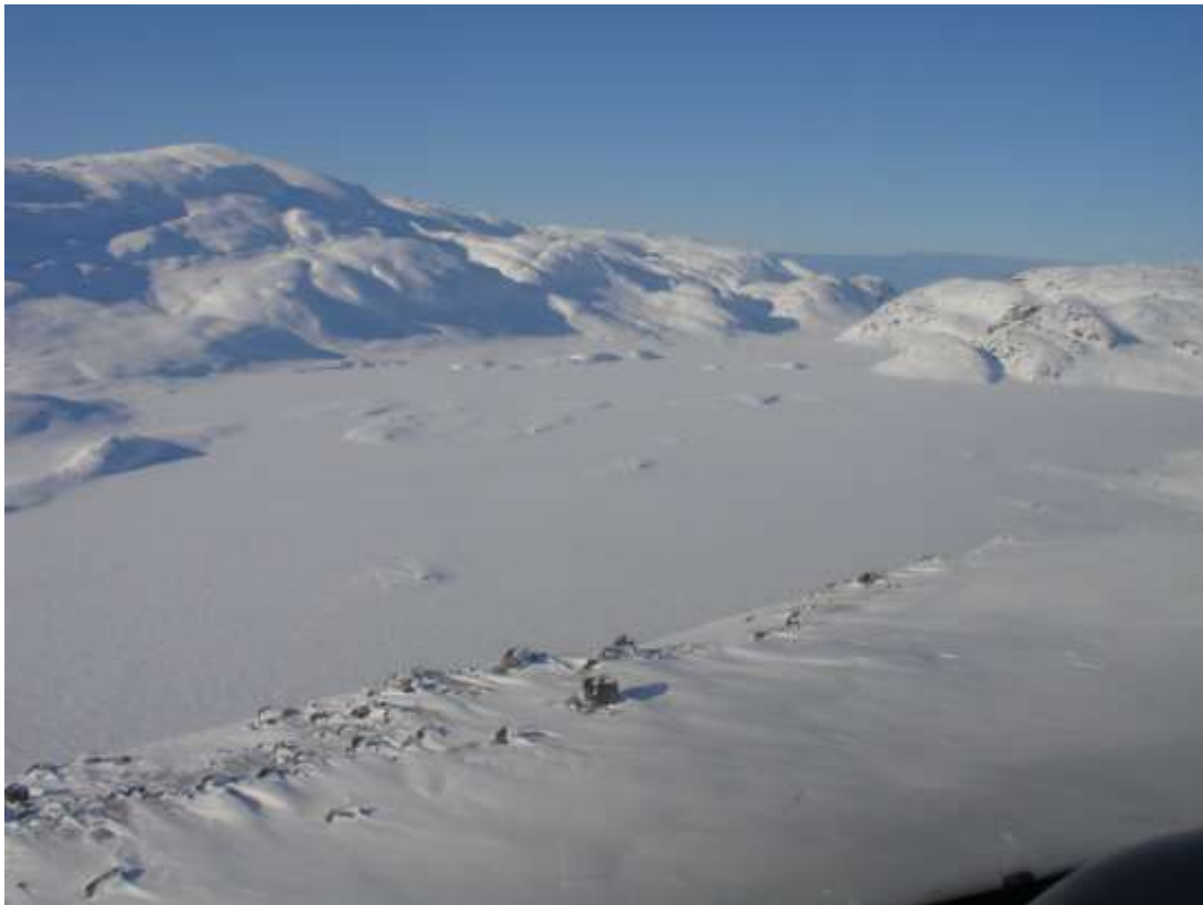
Figure 89. Transect 164, view W, 10 March 2010.