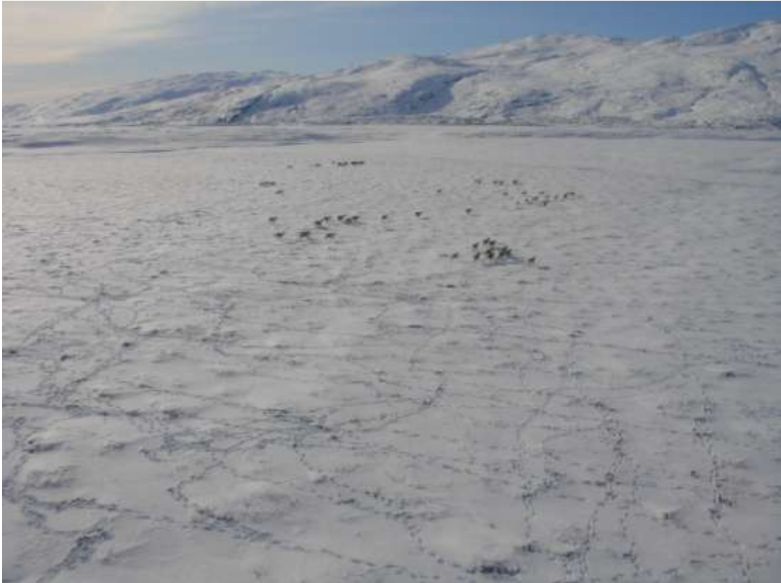
Figure 142. Closer and in this frame there are a minimum of 68 caribou within 300 m, 12 March 2010, north end of Narssarssuaq Valley, view SW, 12 March 2010.