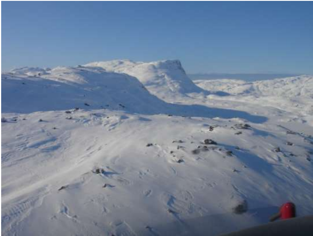
Figure 88. Transect 200, view WSW, 10 March 2010.

AM herd, Central region: High-density stratum, transects in the order flown.