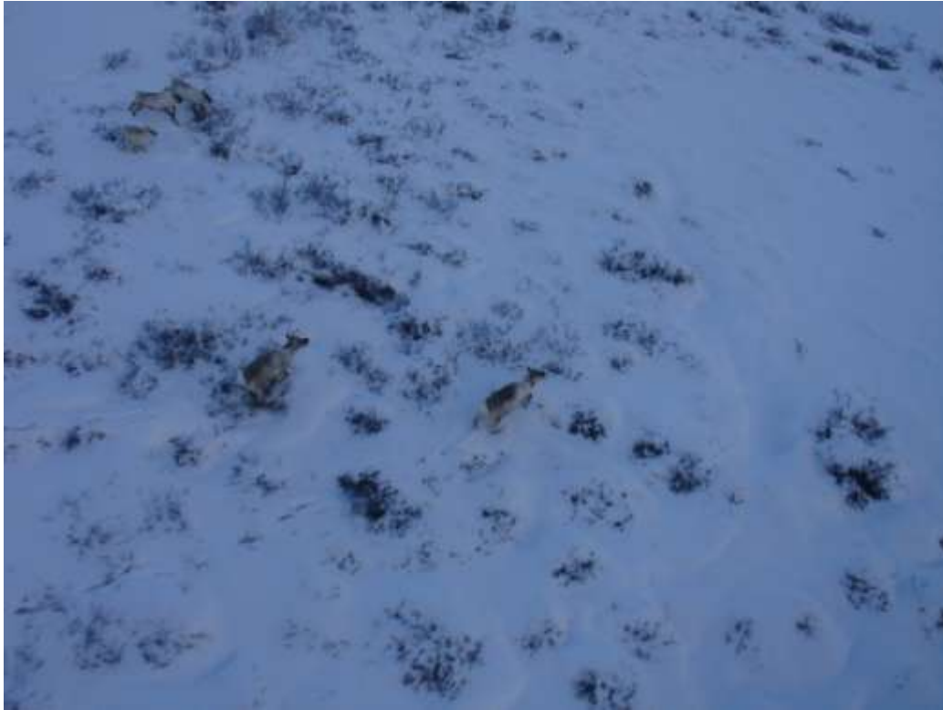
Figure 132. Caribou cow with orange Telonics satellite collar. An antlered juvenile male (age < 3 years) is to her left. Her calf is just below two more caribou in the upper left of this photo, which was taken at the mouth of the Narssarssuaq Valley as it meets Qugsuk Bay, 13 March 2010. Flight height was ca. 15 m.