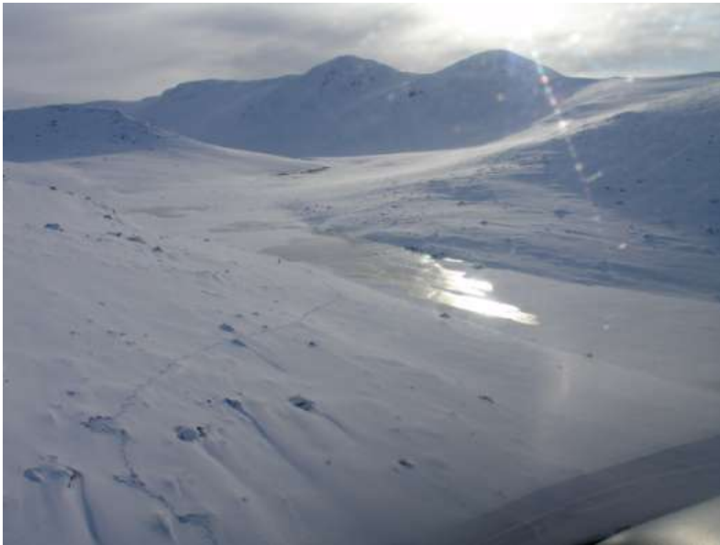
Figure 48. Transect 65, one caribou running away (follow tracks) view to the SE, 5 March 2010.

KS Herd North region: High-density stratum, transects in the order flown.