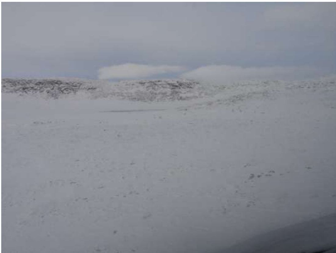
Figure 45. Transect 112, four caribou, view to the NW, 5 March 2010.