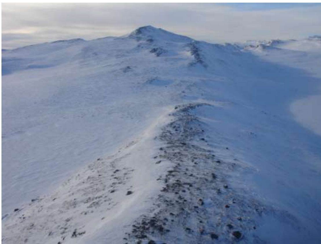
Figure 27. Transect 200, view to the NW, 3 March 2010.