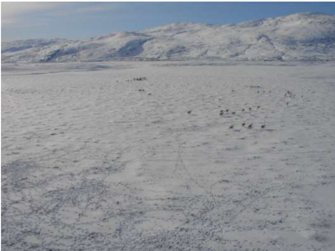
Figure 141. In this frame there are a minimum of 61 caribou within 300 m, 12 March 2010, north end of Narssarssuaq Valley, view SW, 12 March 2010.