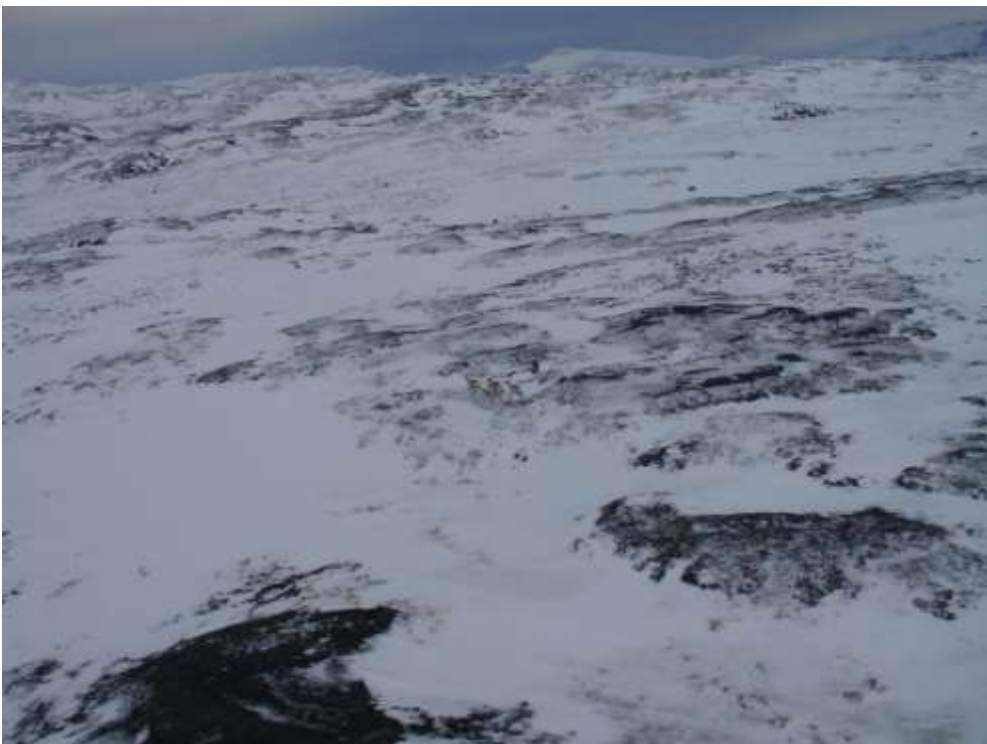
Figure 147. Five caribou ca. 75 m, transect 18, Akia-Maniitsoq, 10 March 2010.