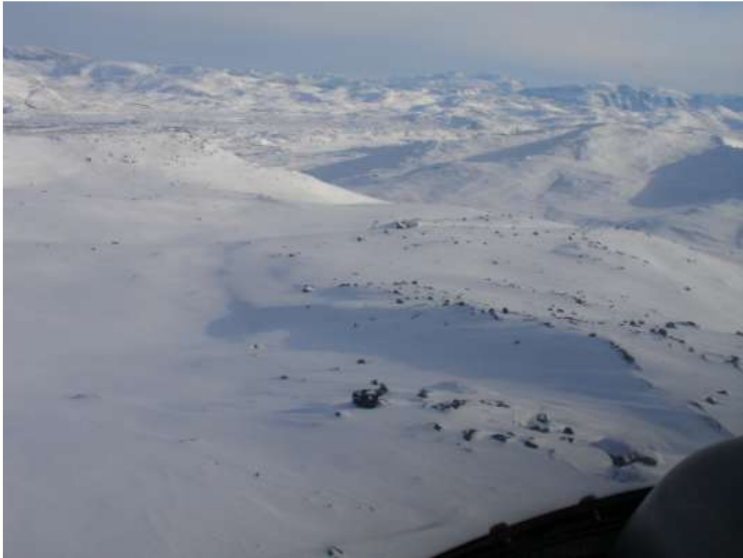
Figure 106. Transect 21, Narssarssuaq Valley in background, view SE, 12 March 2010.

AM herd, Central region: High-density stratum, transects in the order flown.