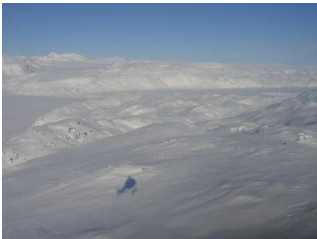
Figure 121. Transect line 52, view to NW, 10 March.