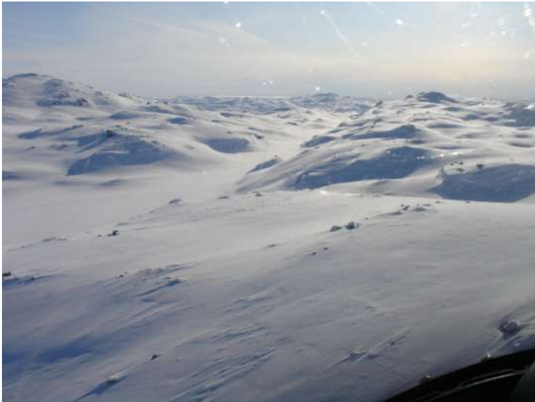
Figure 122. Transect line 95, view to S, 10 March.