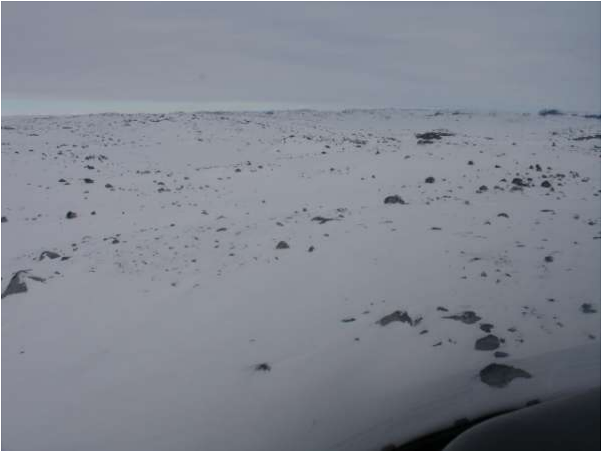
Figure 116. Transect 19, poor light, view NNW, 13 March 2010.

AM herd, Central region: High-density stratum, transects in the order flown.