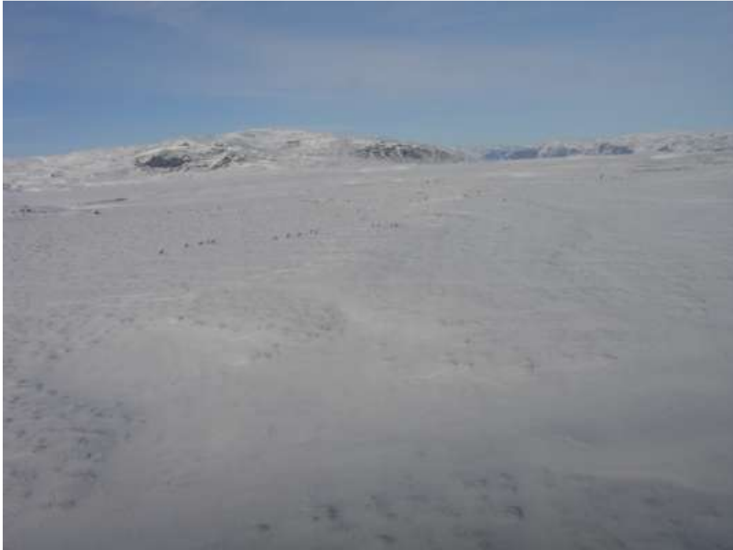
Figure 138. Closer yet again to the same animals as in figure 137, and now a minimum of 50 caribou within 700 m, 12 March 2010, north end of Narssarssuaq Valley, view to north.