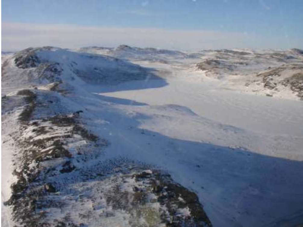
Figure 22. Transect 15, view towards ENE, 3 March 2010.

North region: High-density stratum, transects in the order flown