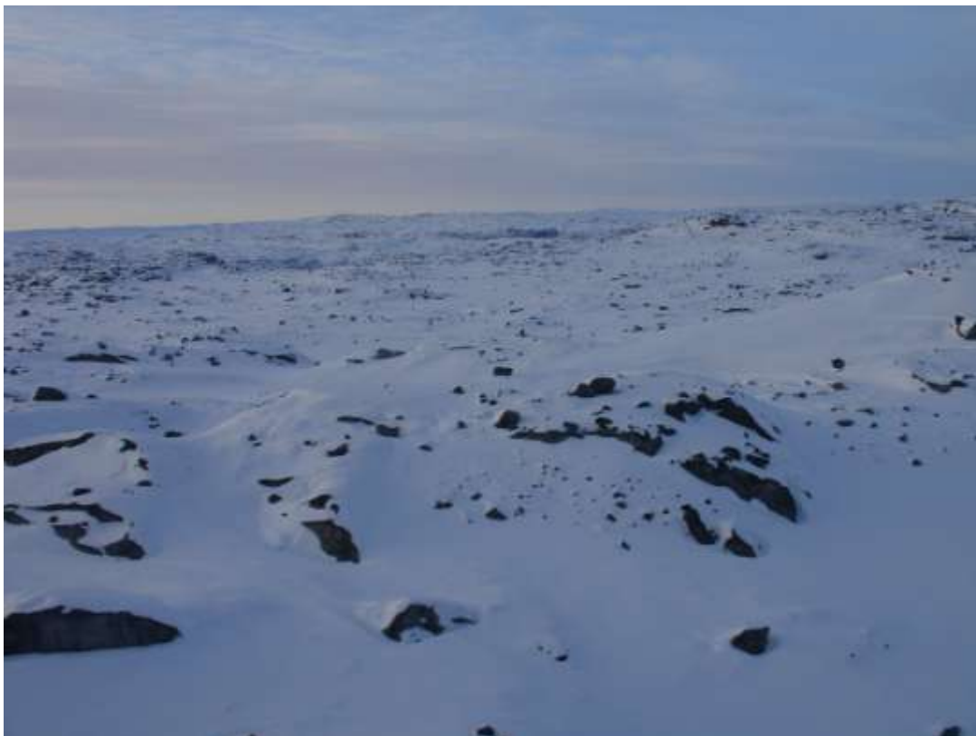
Figure 111. Transect 201, poor light, view NE, 12 March 2010.