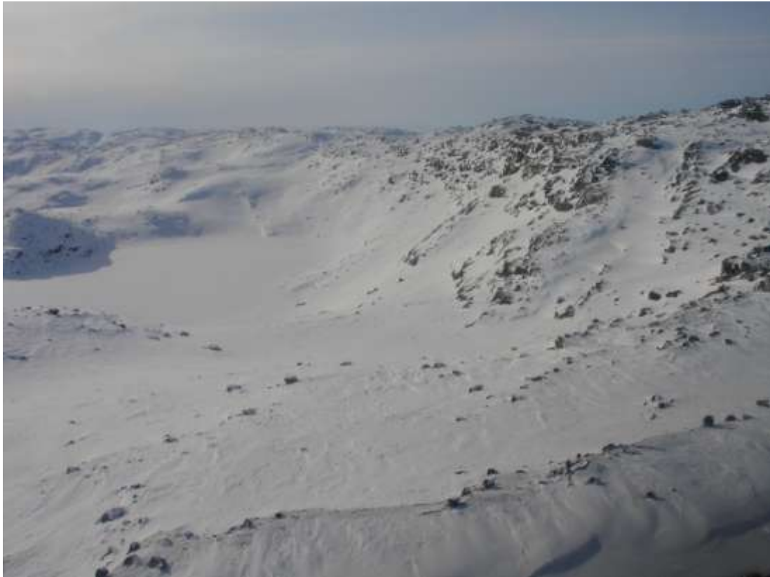
Figure 126. Transect line 149, view SW, 10 March.