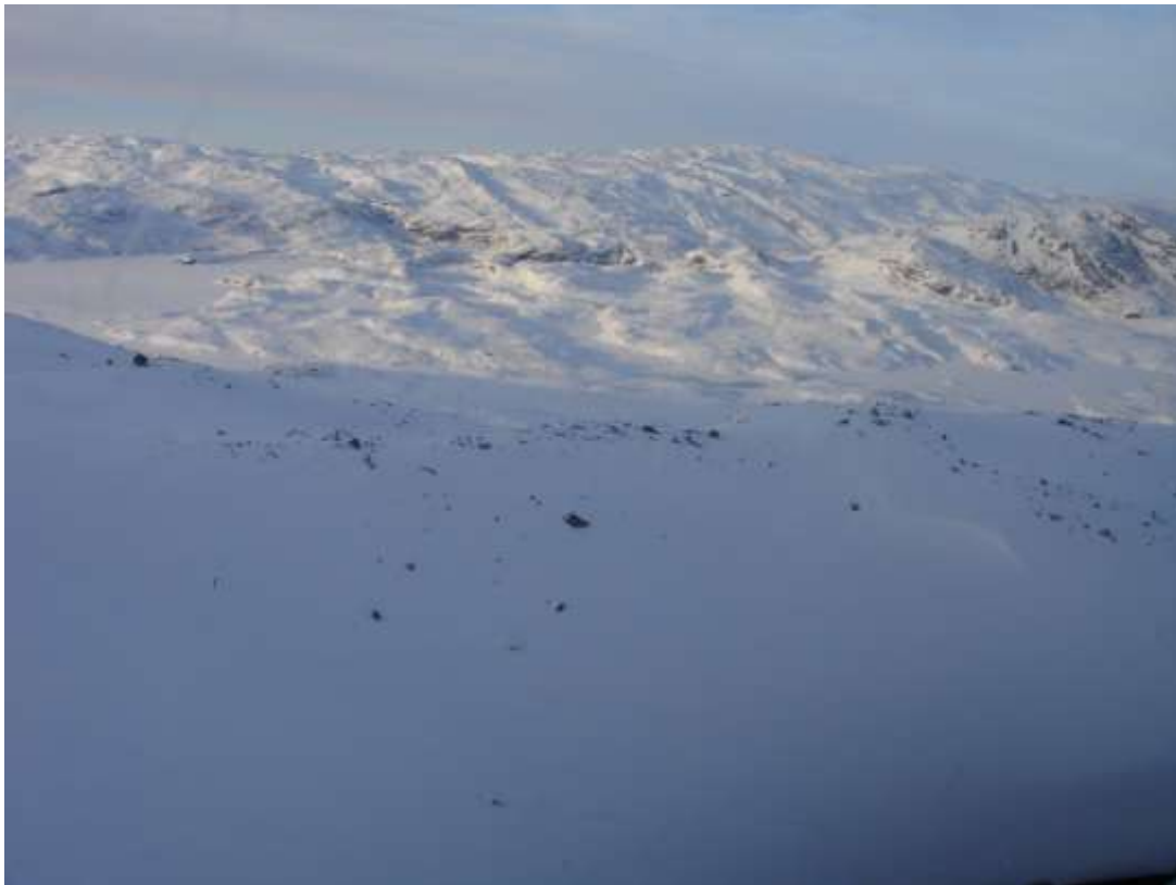
Figure 109. Transect 65, view NW, 12 March 2010.