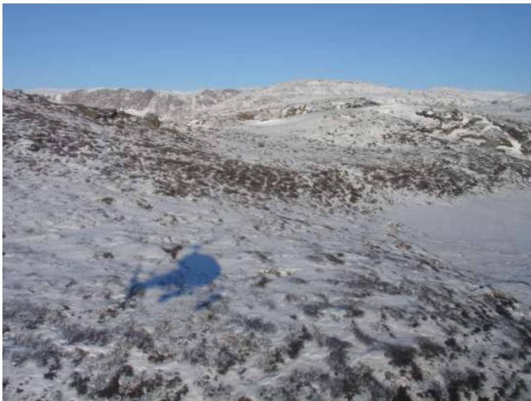
Figure 56. Transect 193, view to the NNW, 6 March 2010.