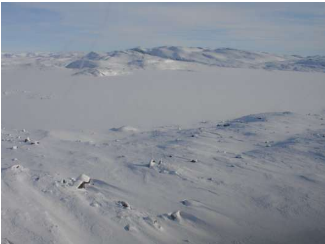
Figure 125. Transect line 28, view to NE, 10 March.