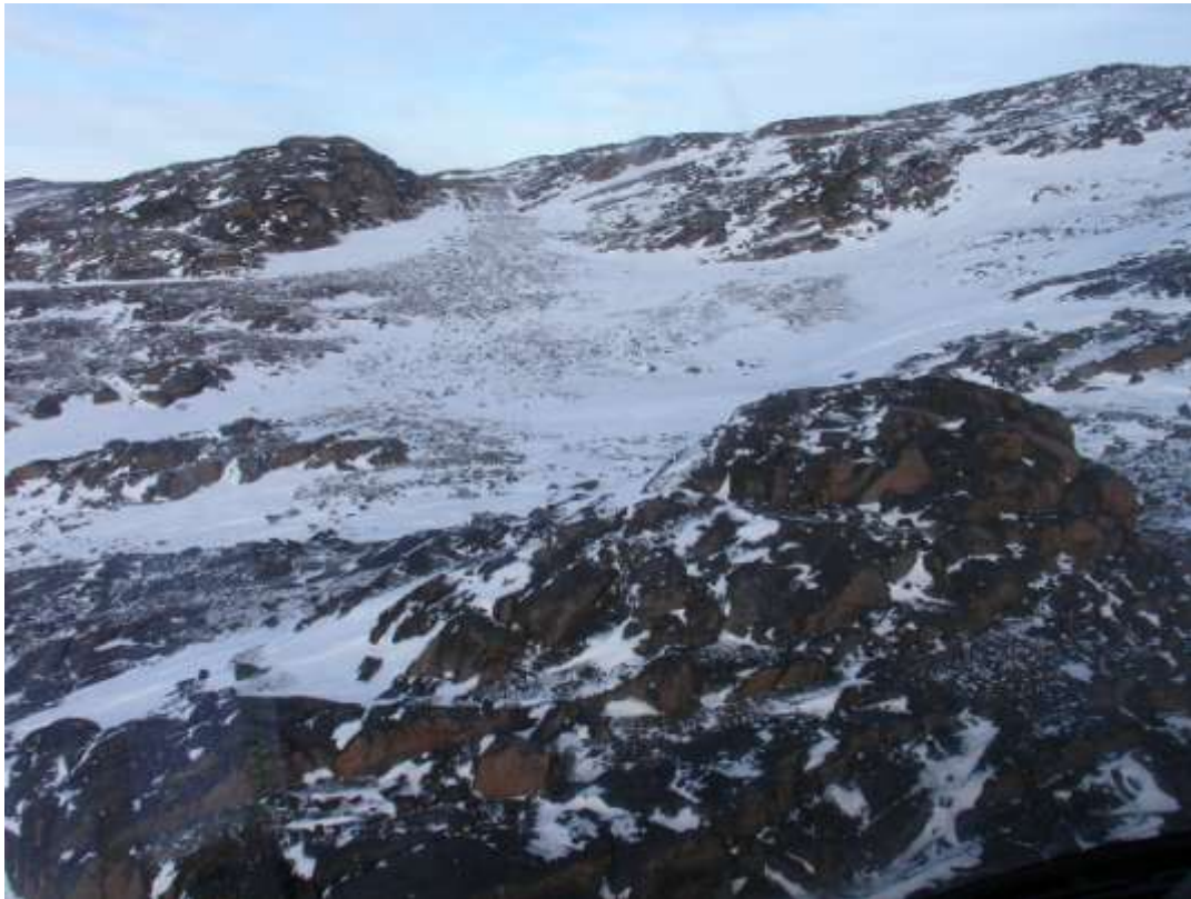
Figure 75. Transect 5, view NE, 8 March 2010.