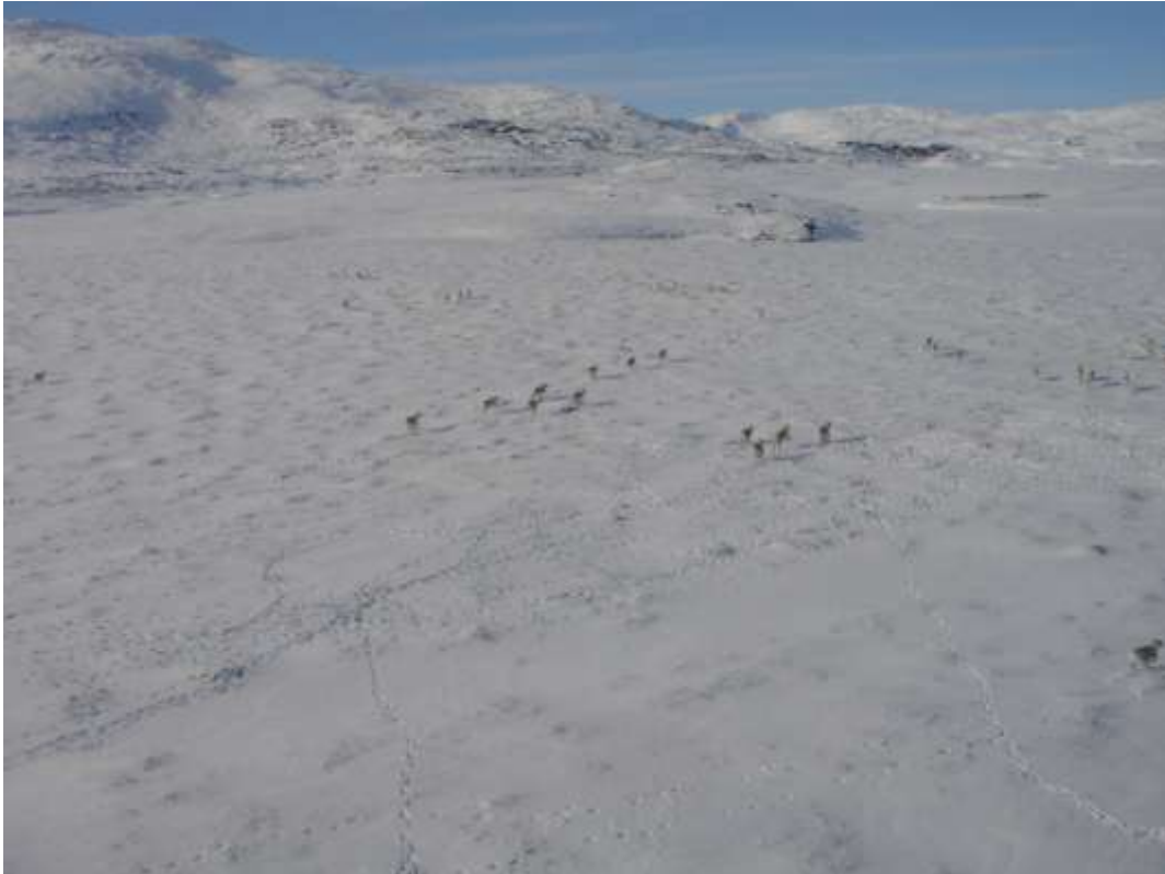
Figure 140. Closer yet again, this time only with a portion of the animals from figure 139, and now there are a minimum of 48 caribou within 300 m, 12 March 2010, north end of Narssarssuaq Valley, view NW, 12 March 2010.