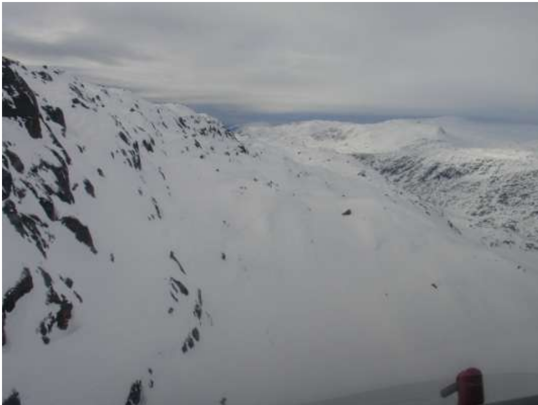
Figure 120. Transect line 139, poor light, unable to see 300 metres to left of helicopter, which is an example of dead ground, view to the W, 9 March.