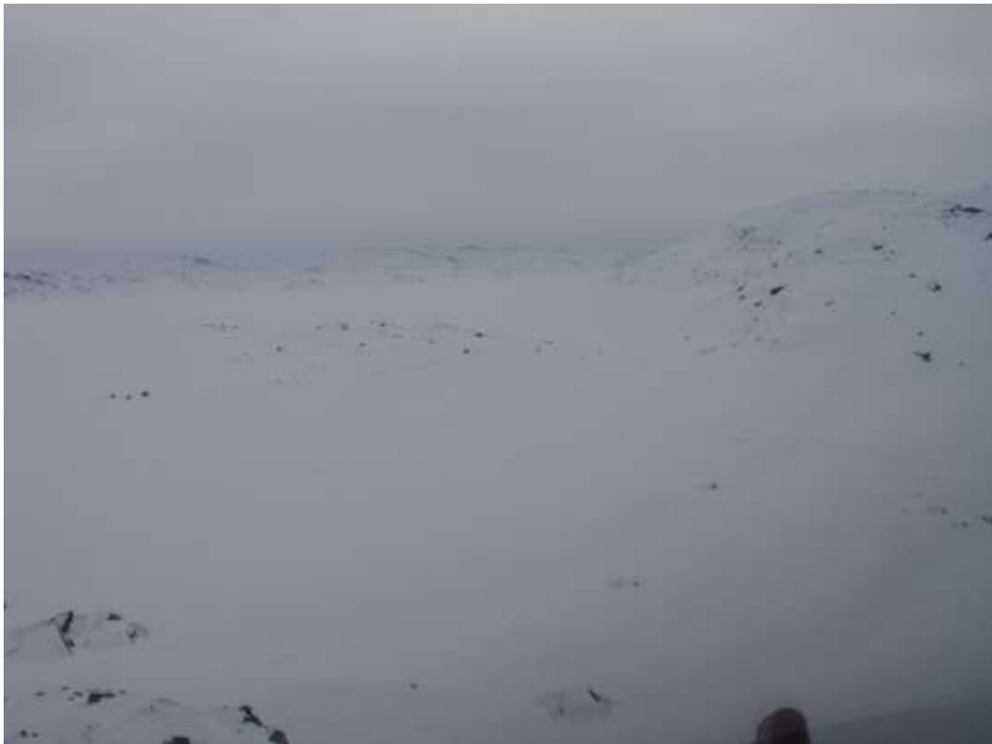
Figure 113. Transect 197, poor light, view E, 13 March 2010.