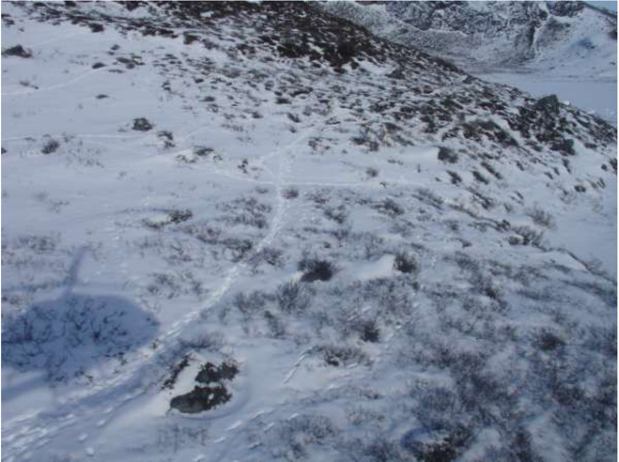
Figure 158. Three caribou < 50 m, Narssarssuaq Valley SE side, 12 March 2010.