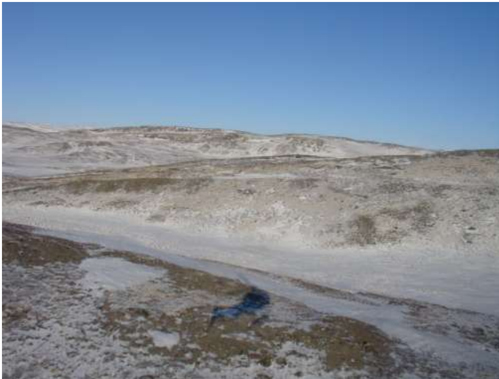
Figure 23. Transect 73, view towards NW, 3 March 2010.