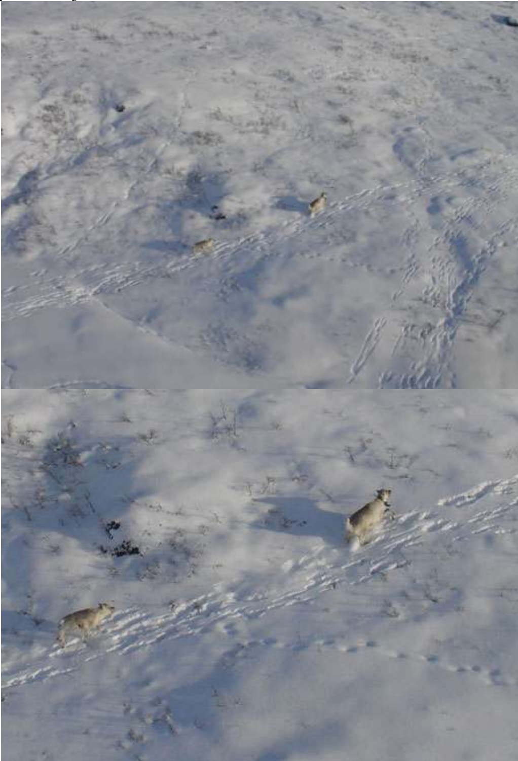
Figure 131. Caribou cow wearing a yellow-black iridium satellite collar with her male calf, at the south end of transect 21, which is at the mouth of the Narssarssuaq Valley as it meets Qugsuk Bay/Fjord. 12 March 2010. Top original photo from 15 m altitude & Bottom: cropped.

Satellite collared caribou cows: Photographs taken during the Akia-Maniitsoq helicopter survey, 9-13 March 2010