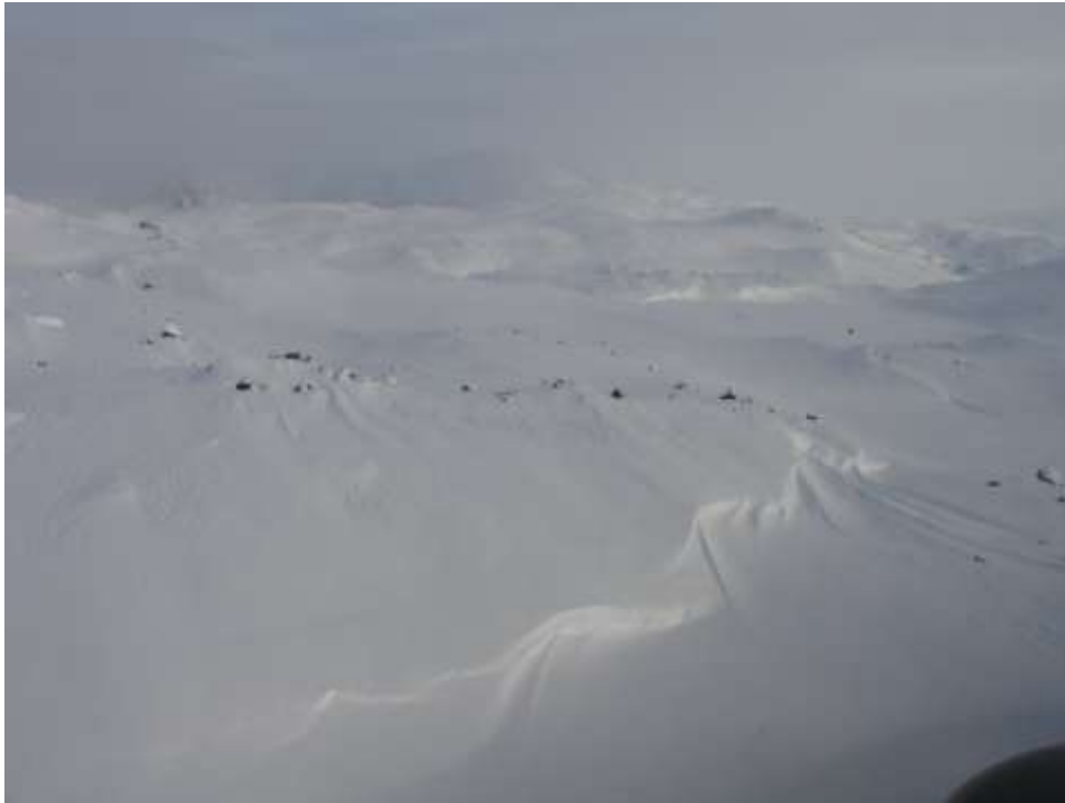
Figure 78. Transect 107, view NE, 9 March 2010.

Central Region: High-density stratum, transects in the order flown.