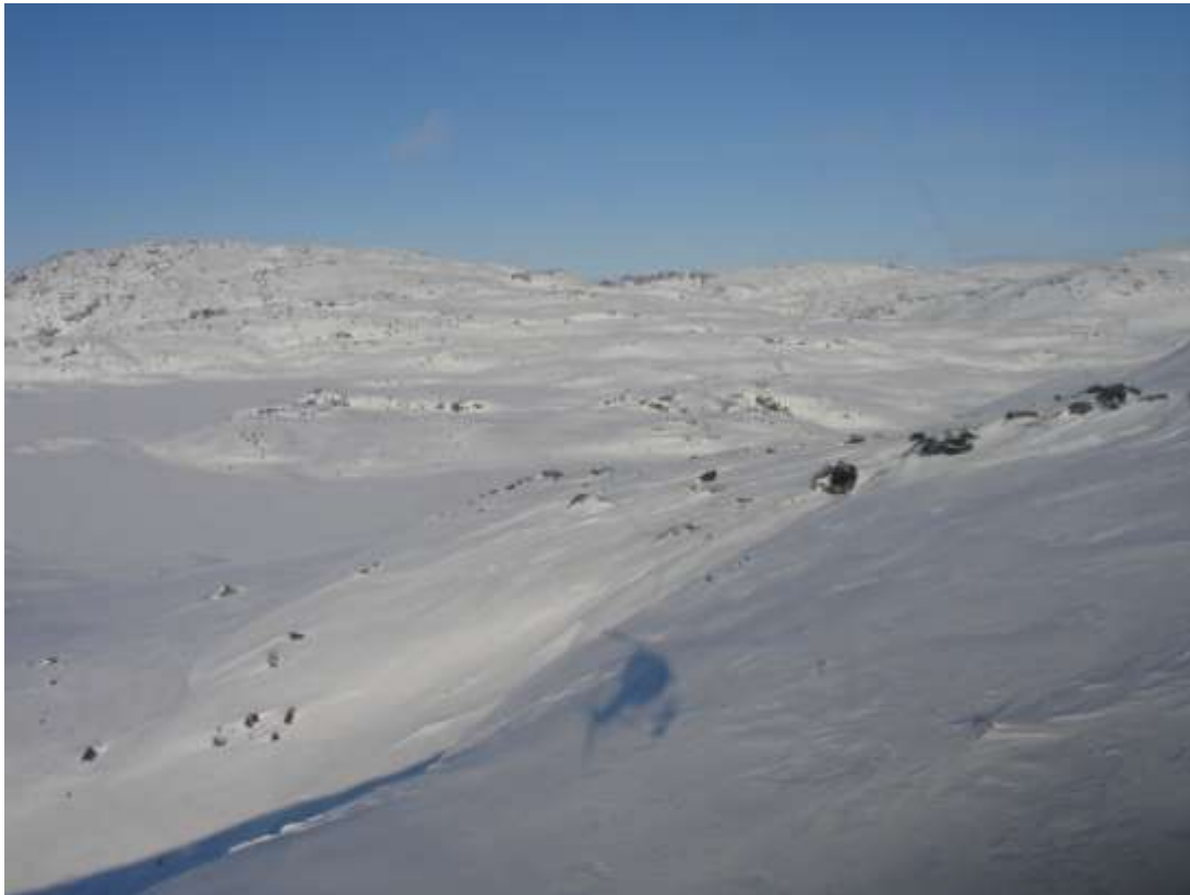
Figure 90. Transect 181, view NW, 10 March 2010.

AM herd, Central region: High-density stratum, transects in the order flown.