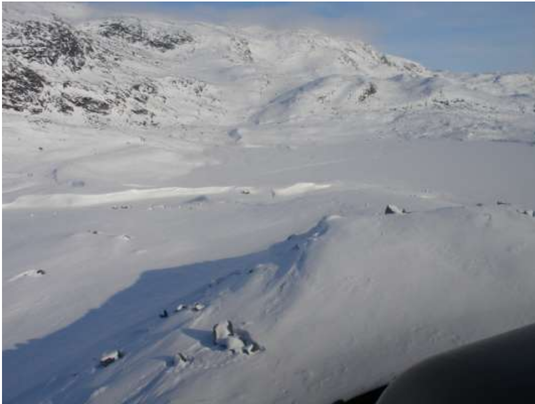
Figure 124. Transect line 121, view to NE, 10 March.