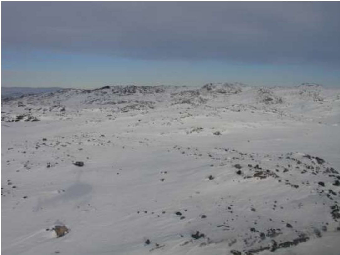
Figure 29. Transect 175, view to the NW from west end, 3 March 2010.