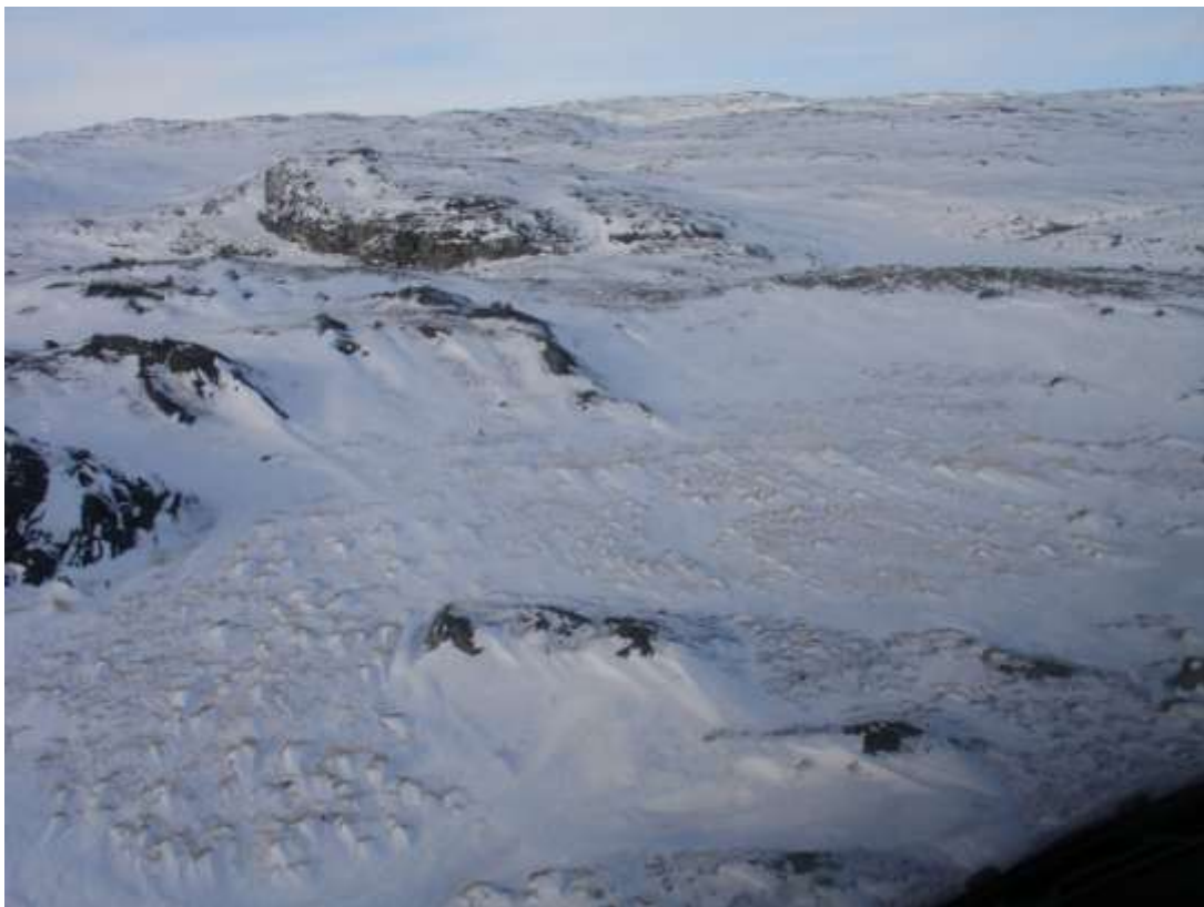
Figure 25. Transect 10, view to the NW, 3 March 2010.