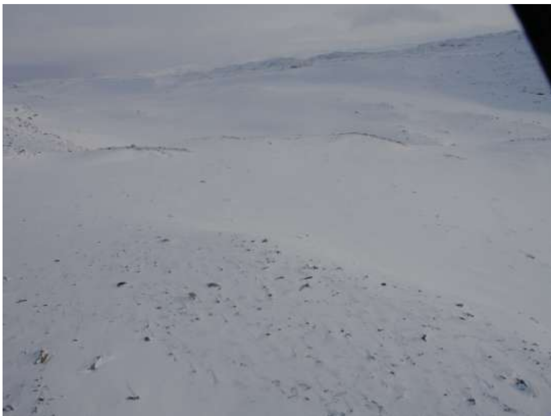
Figure 47. Transect 209, one caribou standing still & looking at us, view to the E, 5 March 2010.