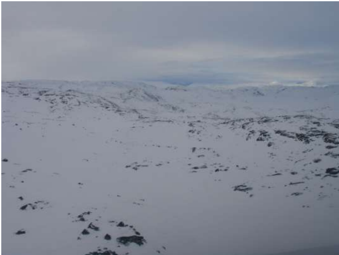
Figure 118. Transect line 168, poor light, view to the SE, 9 March.