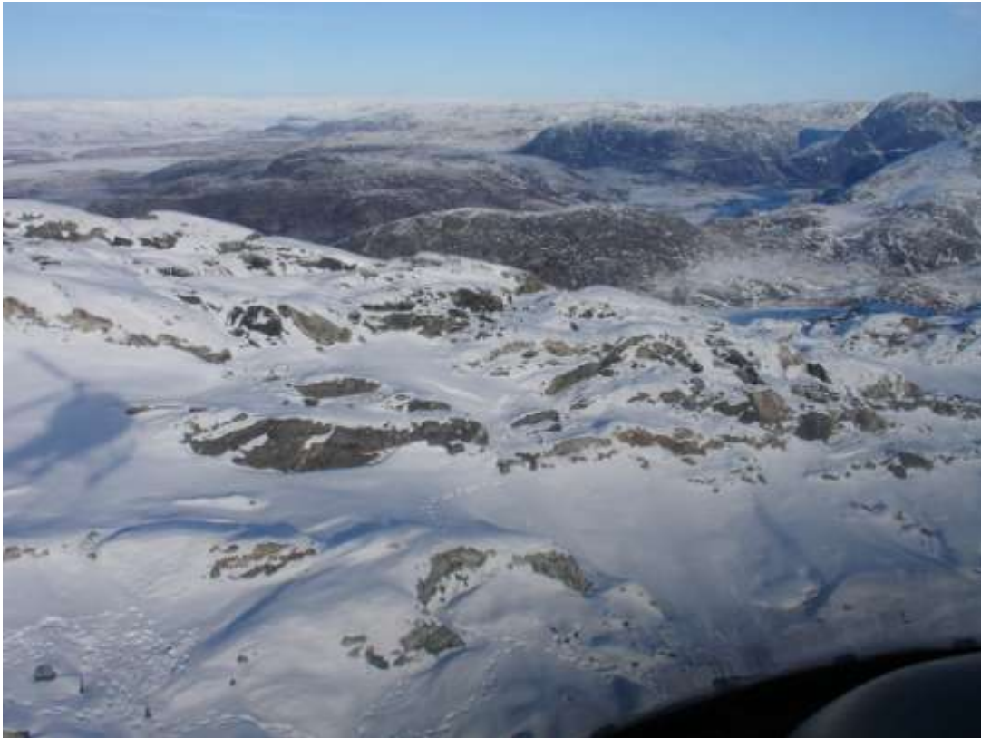
Figure 98. Transect 96, note the snow cover and elevation changes ahead on this transect line, view to the N, 12 March 2010.

AM herd, Central region: High-density stratum, transects in the order flown.