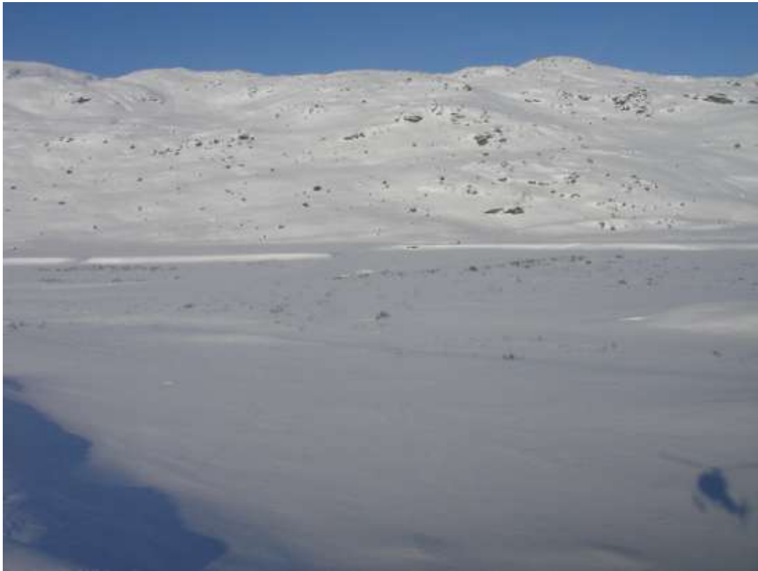
Figure 92. Transect 58, in river bottom, view NW, 10 March 2010.

AM herd, Central region: High-density stratum, transects in the order flown.