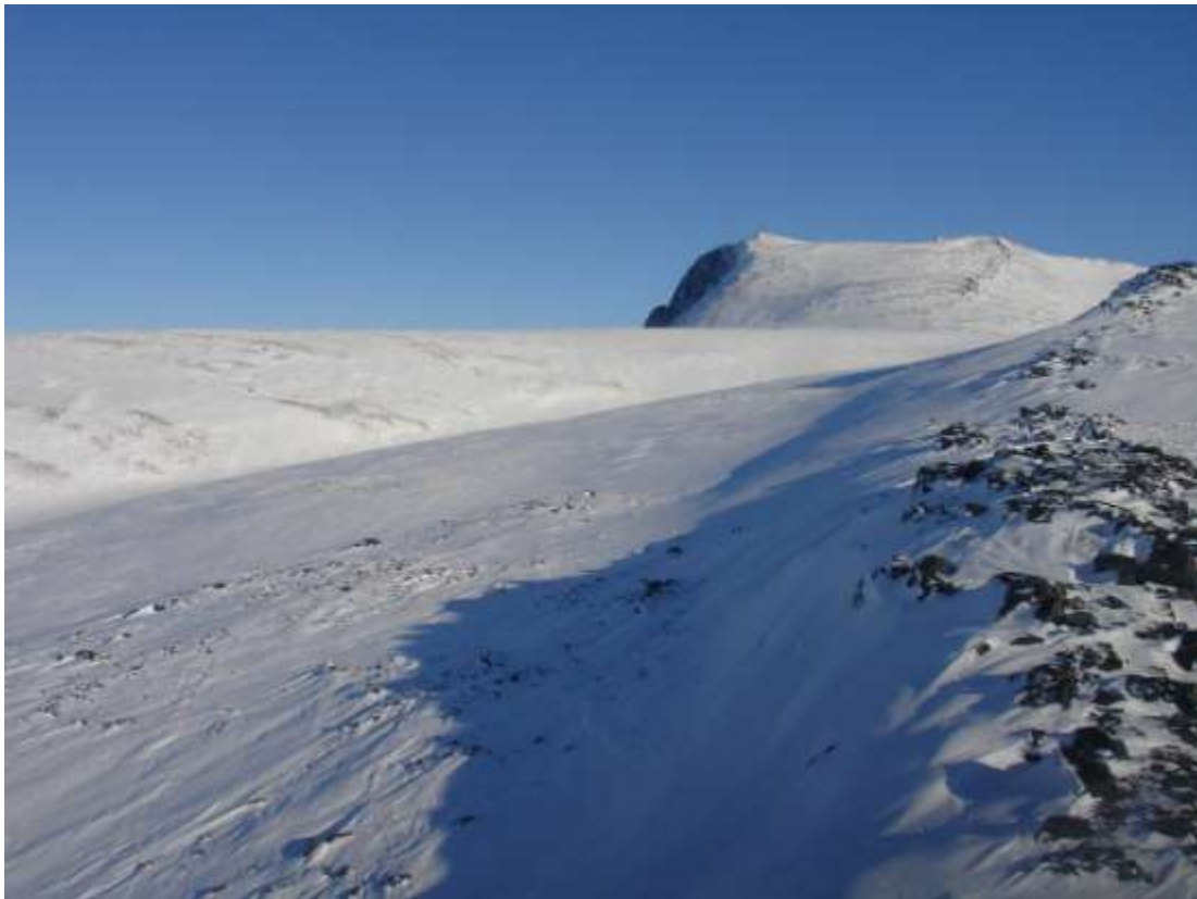
Figure 69. Transect 161, S end of line, view NE to Dye 1 station, 8 March 2010.