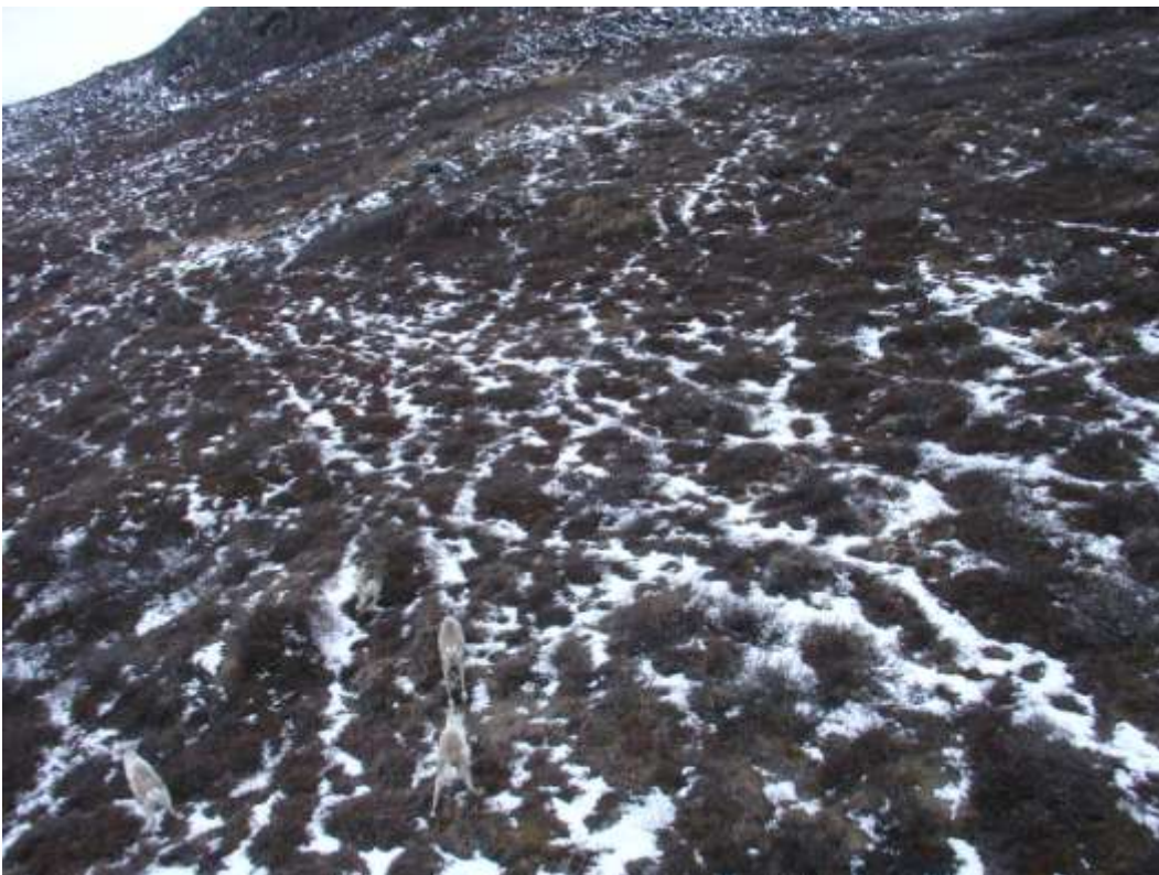
Figure 155. Four caribou < 15 m, Ilulialik, 13 March 2010.