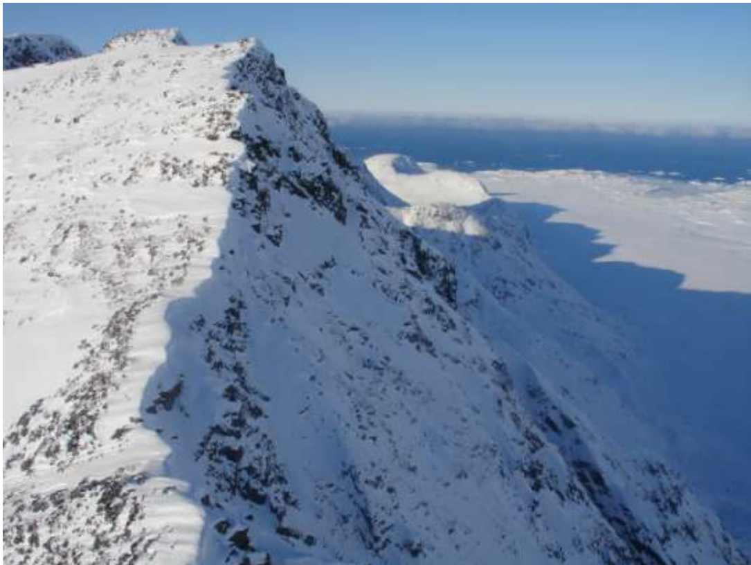
Figure 67. Transect 101 view WNW, 8 March 2010.