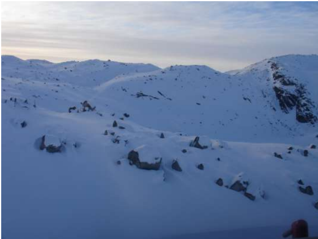
Figure 110. Transect 186, poor light, view NW, 12 March 2010.

AM herd, Central region: High-density stratum, transects in the order flown.