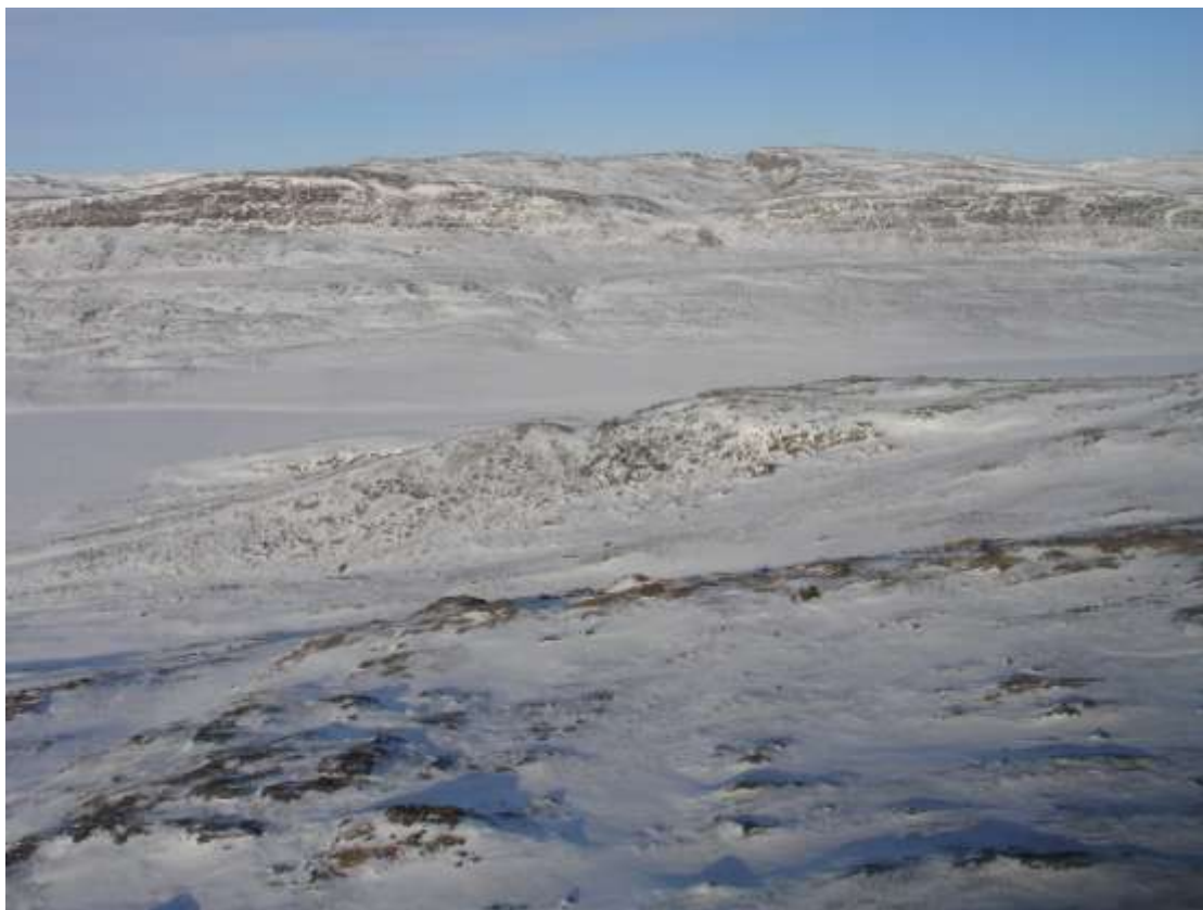
Figure 26. Transect 34, view to the NE, 3 March 2010.