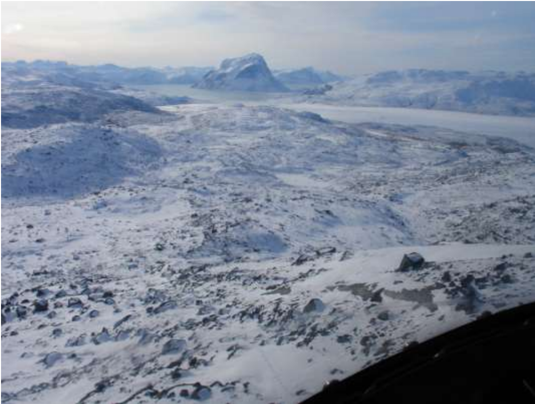
Figure 102. Transect 108, Ilulialik fjord & Bird Mountain in background, view SSW, 12 March 2010.

AM herd, Central region: High-density stratum, transects in the order flown.