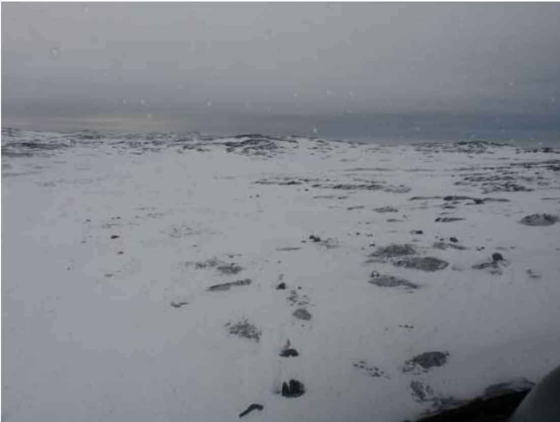
Figure 82. Transect 97, rain on windshield, view SW, 9 March 2010.

AM herd, Central region: High-density stratum, transects in the order flown.