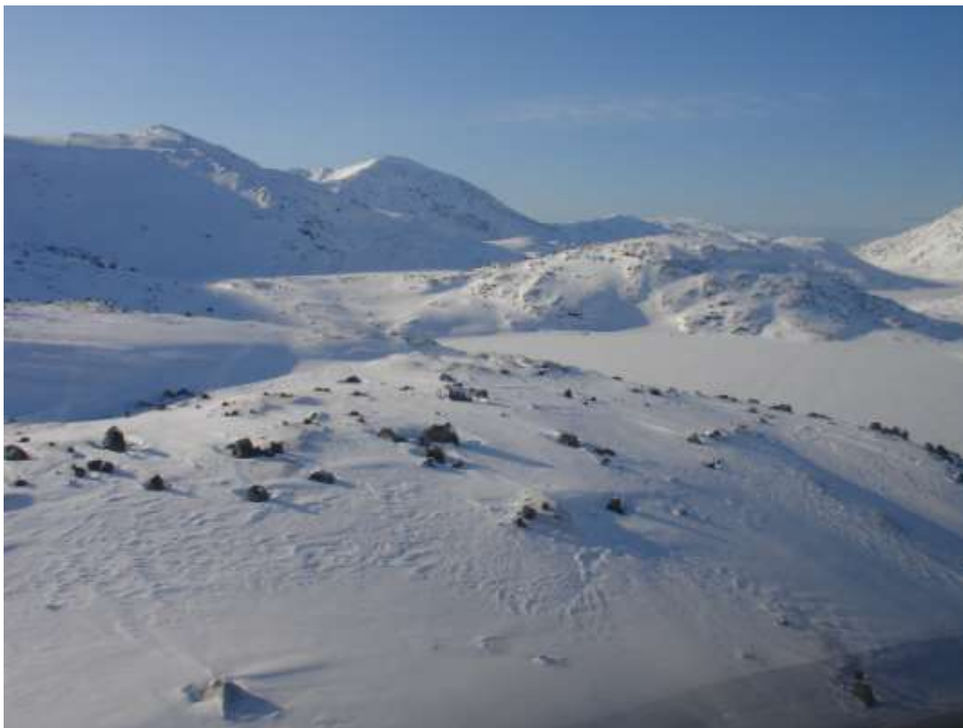
Figure 91. Transect 199, view SSW, 10 March 2010.