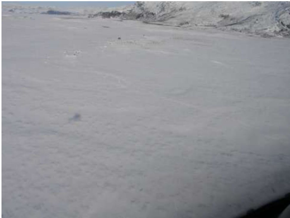
Figure 134. Minimum 31 caribou within < 1 km of helicopter, 12 March 2010, north end of Narssarsuaq Valley, view NE.