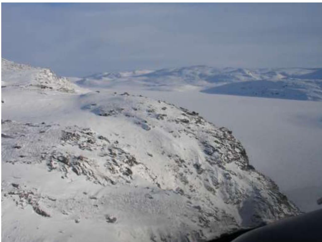
Figure 49. Transect 172, view to the NE, 5 March 2010.