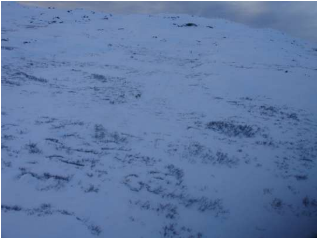
Figure 153. Three caribou < 100 m, at mouth of the Narssarssuaq Valley to Qugsuk Bay, Akia-Maniitsoq, 13 March 2010.