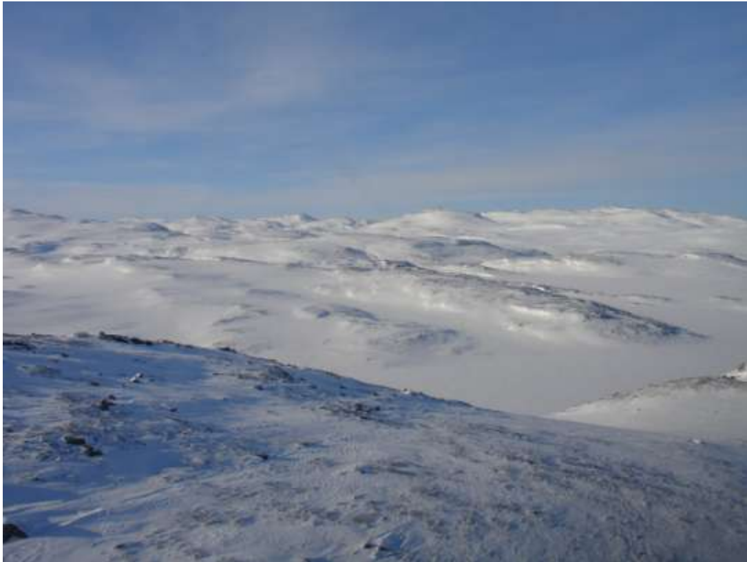
Figure 28. Transect 211, view to the NW, 3 March 2010.