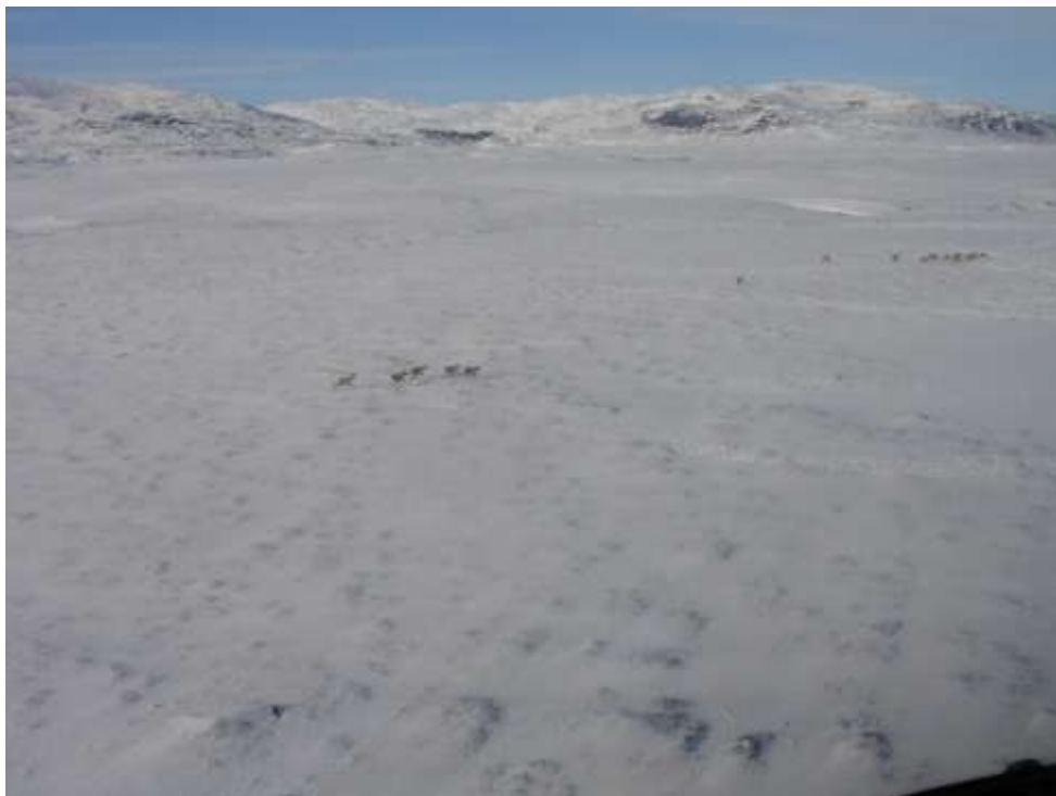
Figure 135. Group of 5 & 12 caribou, and minimum 25 more in far background, 12 March 2010, north end of Narssarsuaq Valley, view NW.