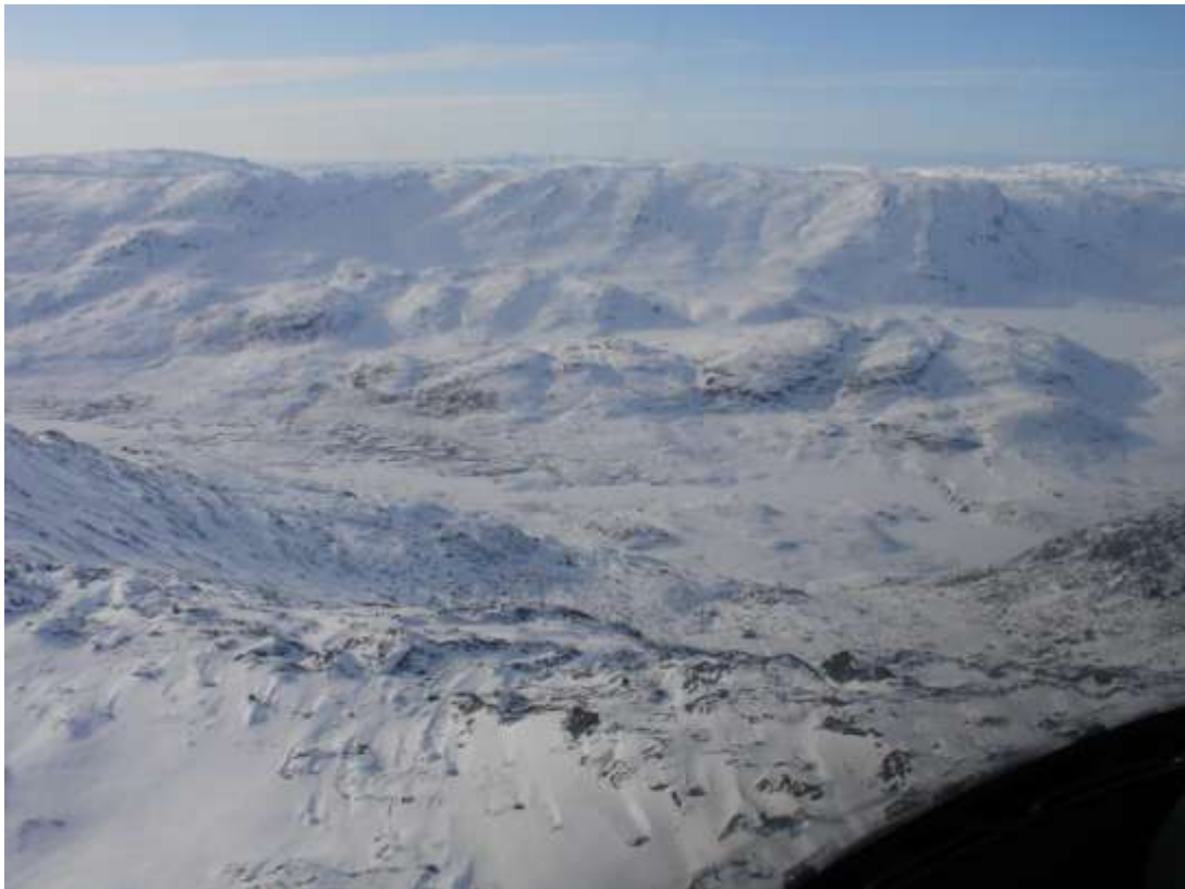
Figure 104. Transect 36, "Eldorado", view NW along zero line, 12 March 2010.

AM herd, Central region: High-density stratum, transects in the order flown.