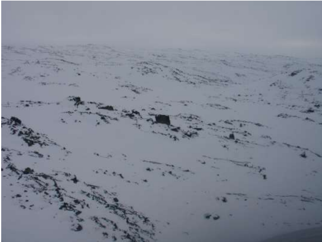
Figure 112. Transect 203, poor light, view NE, 13 March 2010.

AM herd, Central region: High-density stratum, transects in the order flown.