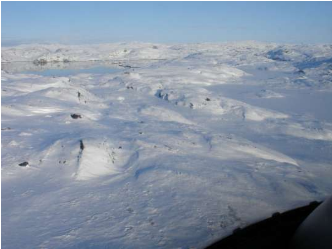
Figure 86. Transect 124, Fiskefjord in background, view N, 10 March 2010.

AM herd, Central region: High-density stratum, transects in the order flown.