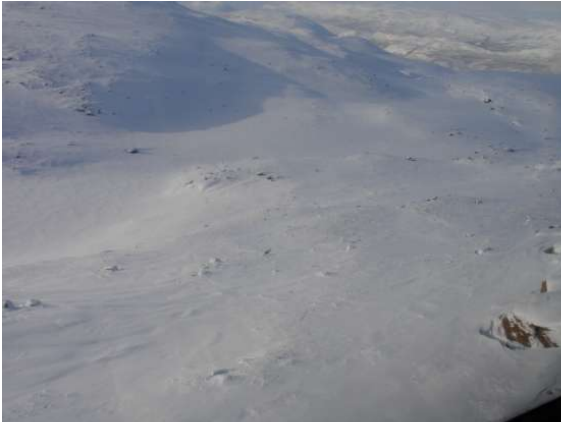
Figure 42. Transect 197, view to WNW, 1 caribou in highlands, 5 March 2010.

KS Herd North region: High-density stratum, transects in the order flown.