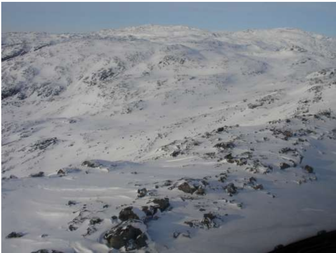
Figure 93. Transect 56, view NW, 10 March 2010.