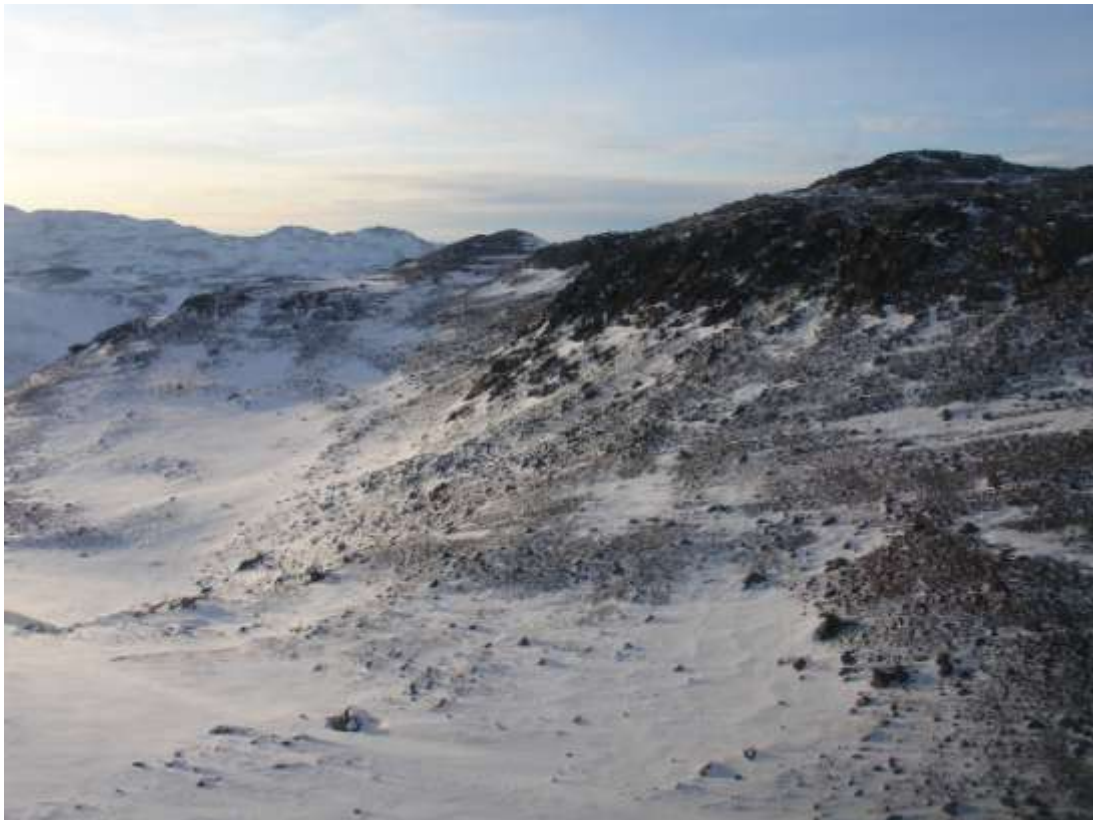
Figure 61. Transect 8, view to the NW, 3 March 2010.