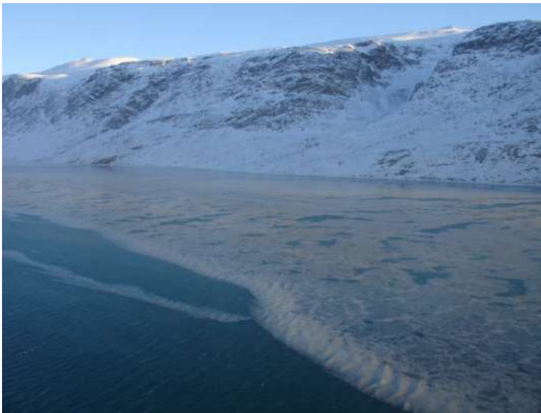
Figure 64. Transect 143, open fjord at the N end of Transect, view to the SE, 6 March 2010.