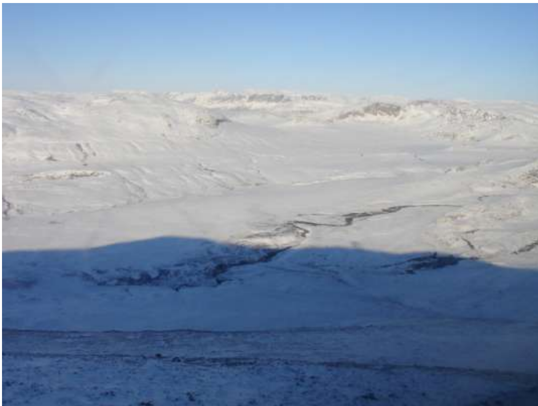
Figure 55. Transect 203, view to the NW, 6 March 2010.