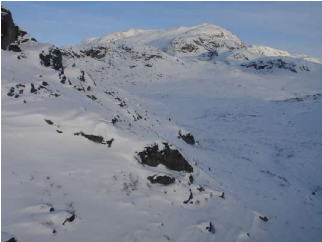
Figure 108. Transect 46, view SE, 12 March 2010.

AM herd, Central region: High-density stratum, transects in the order flown.