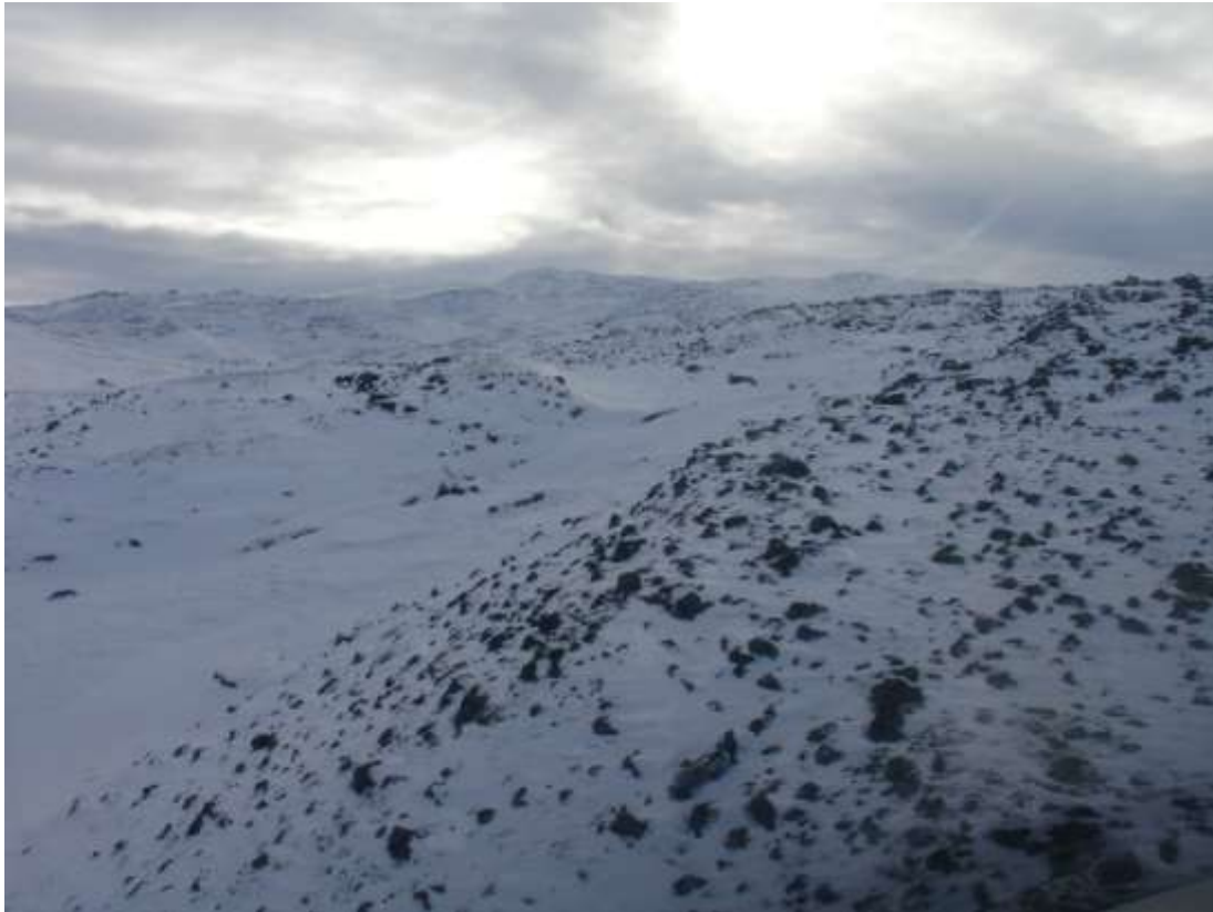
Figure 116. Transect line 105, view to the SSE, 9 March.