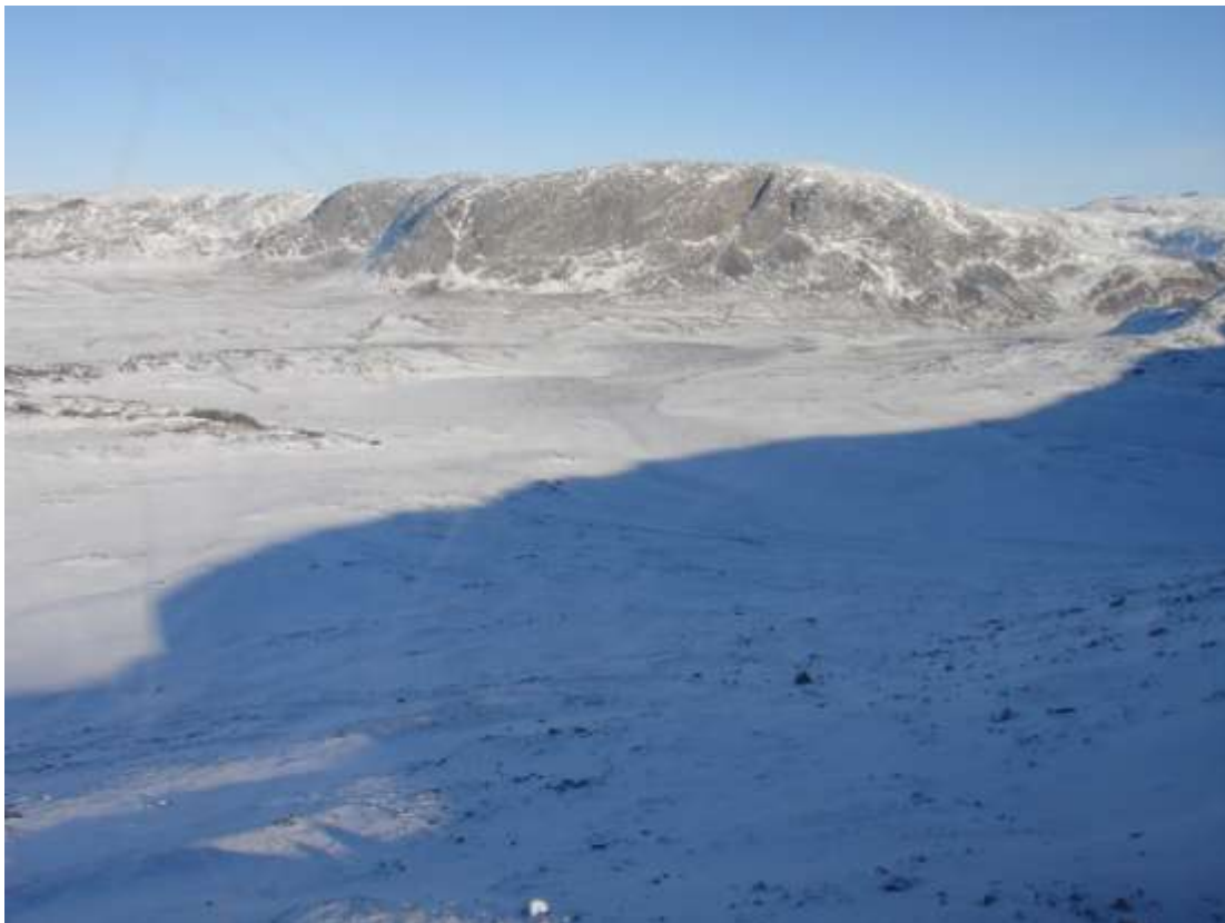
Figure 70. Transect 151, S end of line, view NE, 8 March 2010.