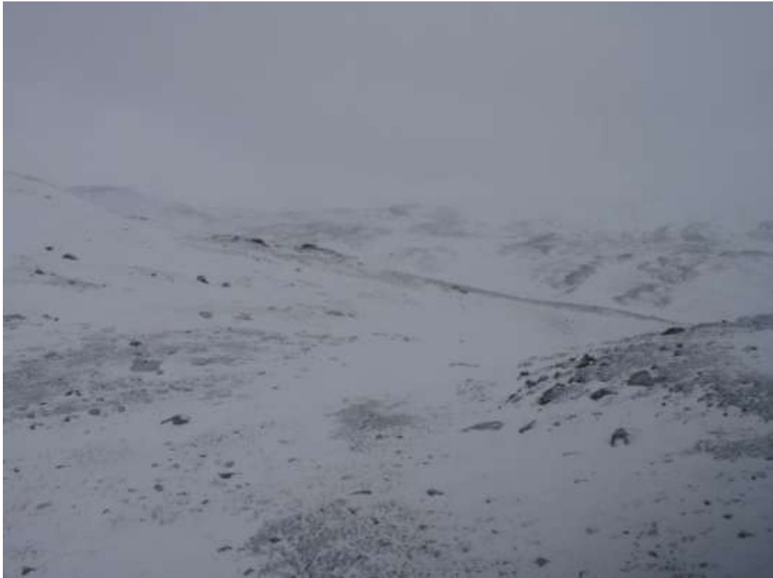
Figure 38. Transect 58, view to the W, poor light & foggy, 4 March 2010.