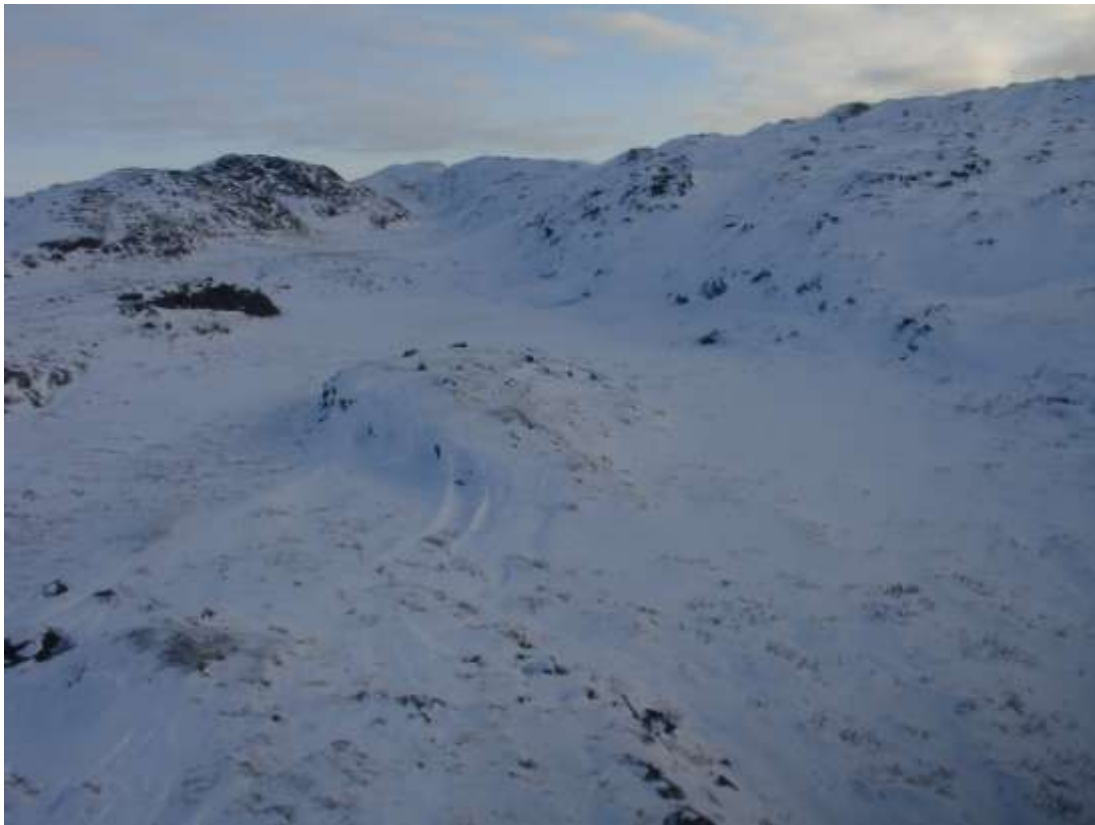
Figure 85. Transect 227, view ENE, 10 March 2010.