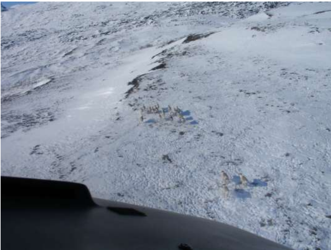
Figure 145. Large group of 15 caribou, followed by three, while in the upper right on the ridge are two more caribou, 13 March 2010, at the southern mouth of the Narssarssuaq Valley where it meets Qugsuk Bay.