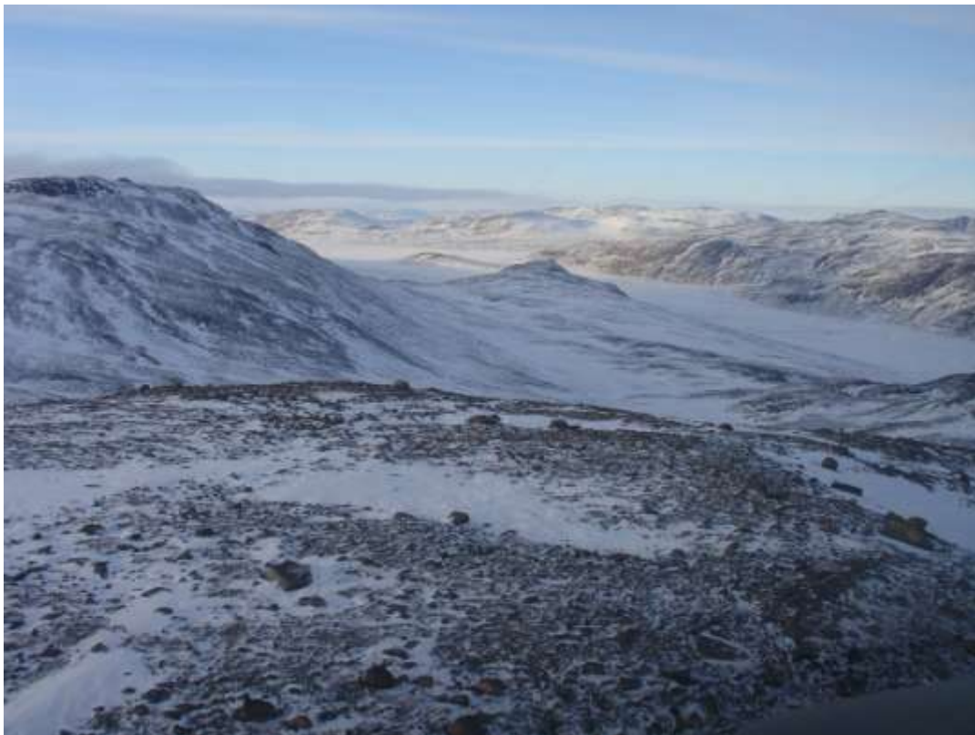
Figure 76. Transect 135, view N, 8 March 2010.