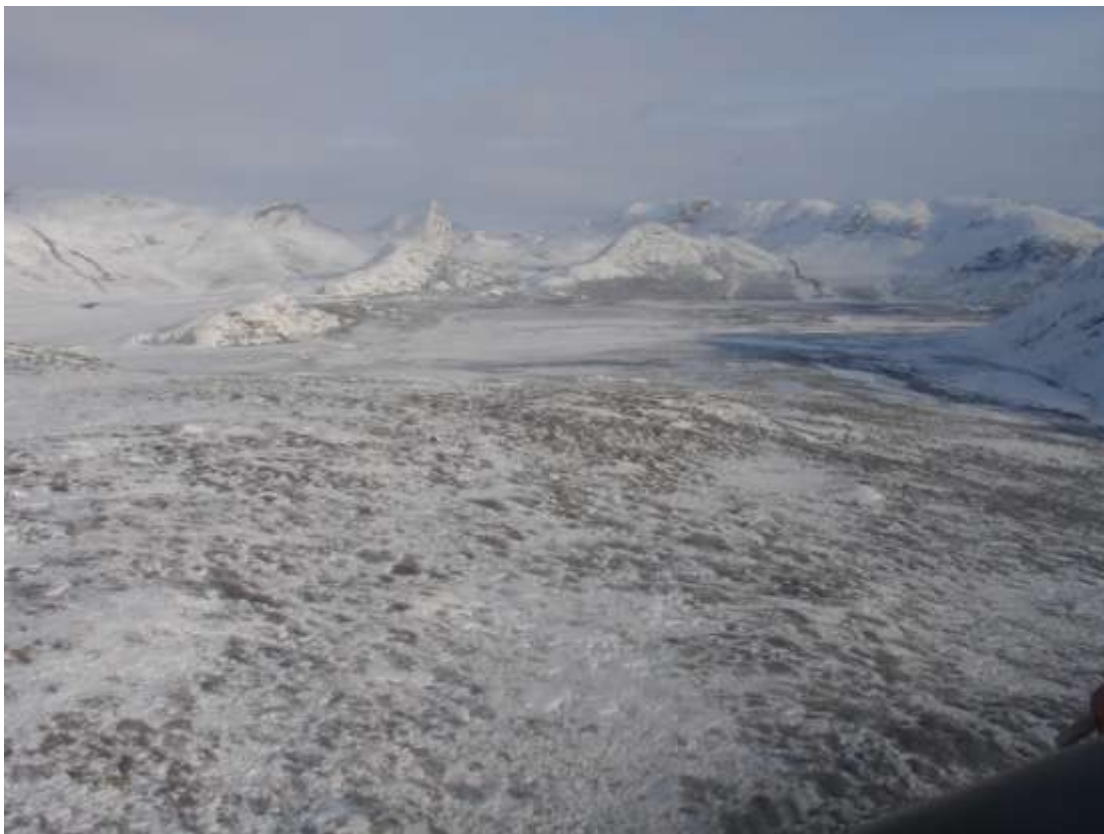
Figure 43. Transect 197, view to E in valley at N end transect, 5 March 2010.