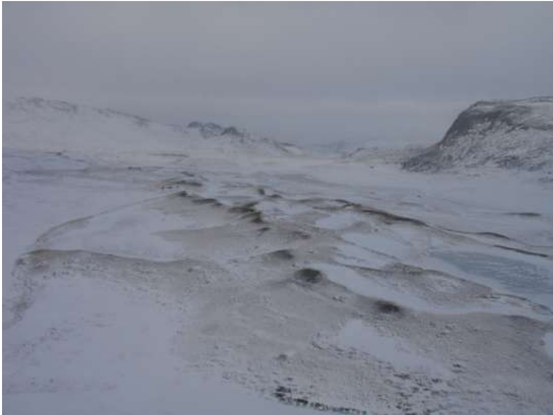
Figure 36. Transect 192, view NNW, valley dunes in poor light, 4 March 2010.