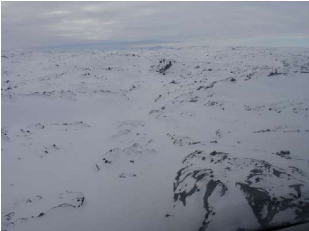
Figure 115. Transect 141, poor light, view S, 13 March 2010.