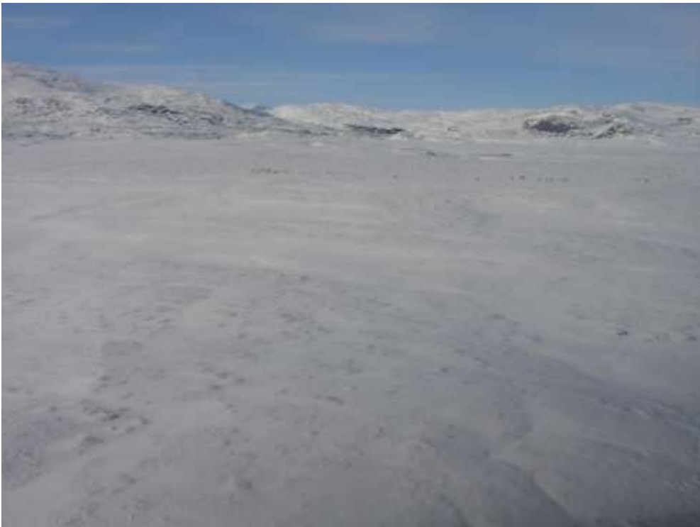
Figure 137. This is the same far background as figure 136, however, now a minimum of 40 caribou, 12 March 2010, north end of Narssarssuaq Valley, view NW.