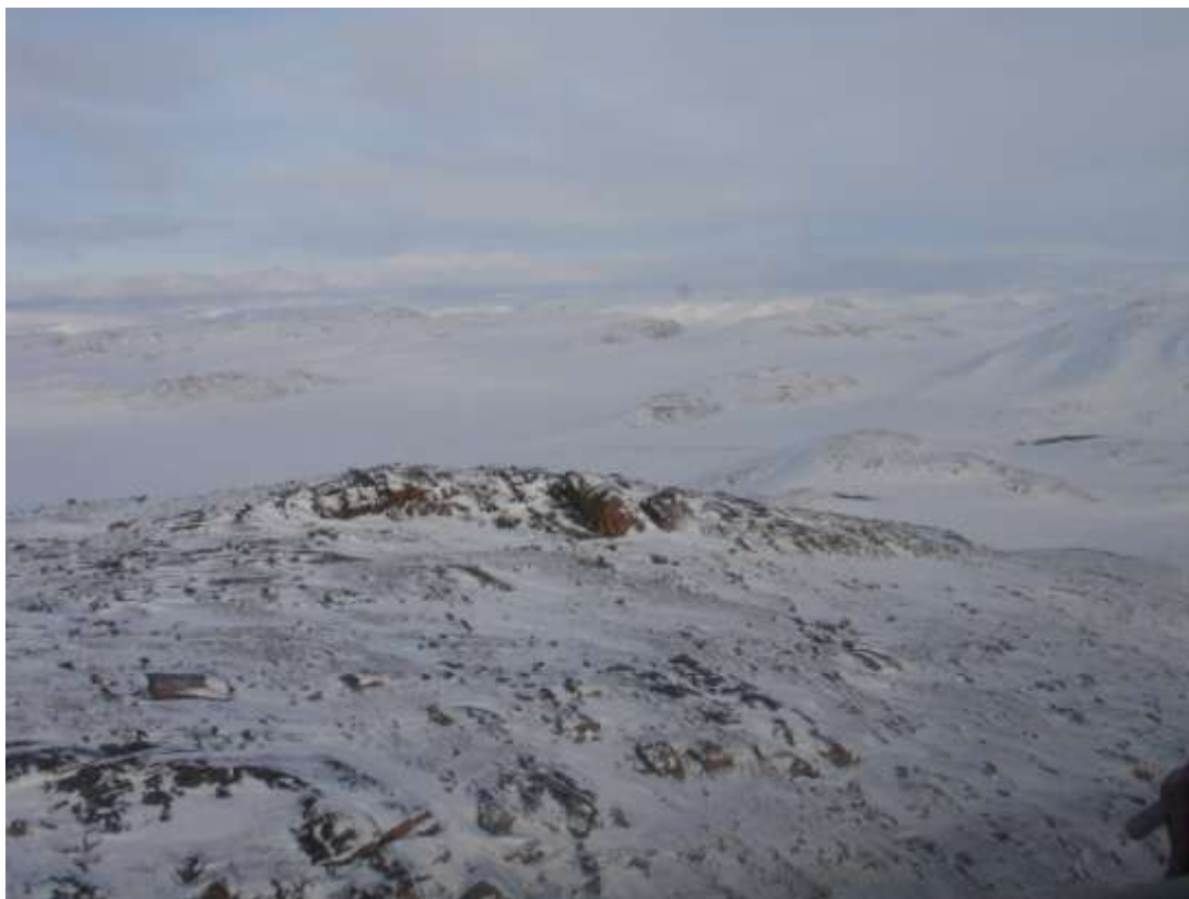
Figure 50. Transect 92, view to the NW, 5 March 2010.