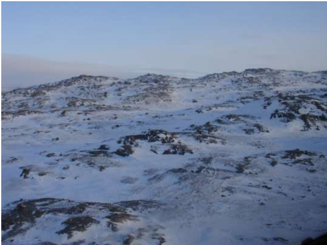
Figure 32. Transect 9, view NE, 4 March 2010.

KS Herd North region: High-density stratum, transects in the order flown.