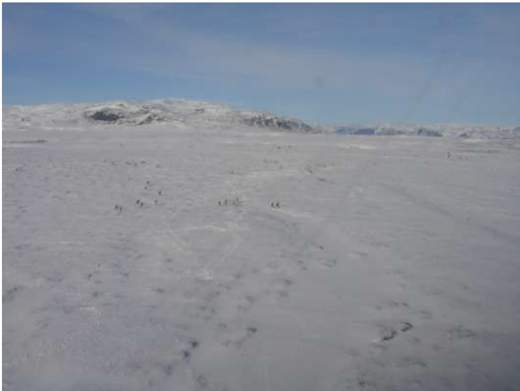
Figure 139. Closer yet again to the same animals as in figure 138, and now a minimum of 58 caribou within 700 m, 12 March 2010, north end of Narssarssuaq Valley, view north.