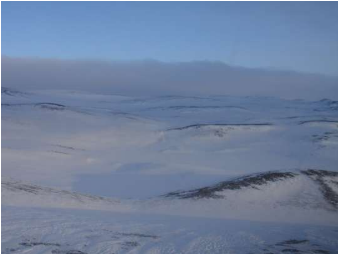
Figure 31. Transect 153, view to the NE, 4 March 2010.