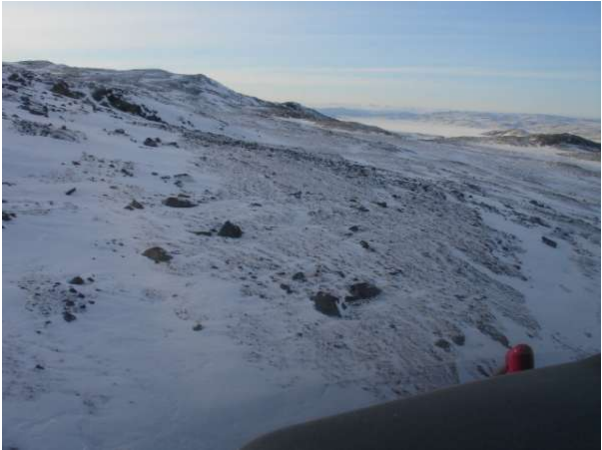
Figure 77. Transect 61, poor light, view NW, 8 March 2010.