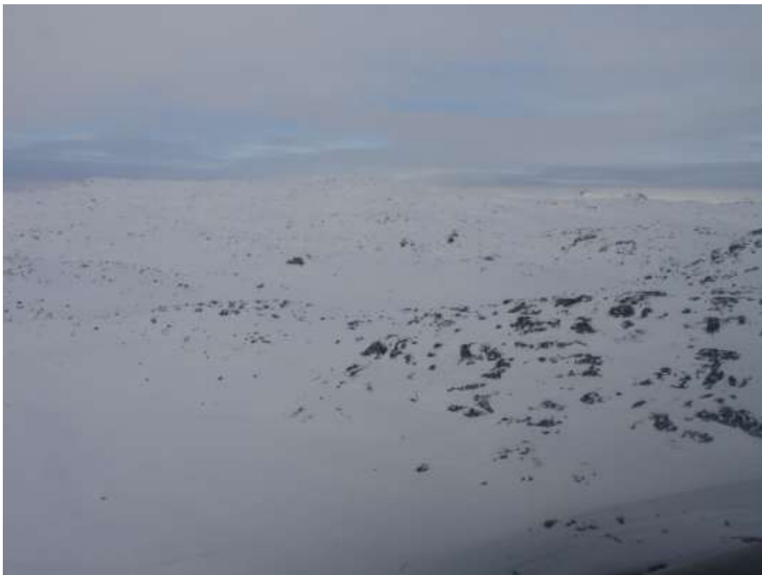
Figure 119. Transect line 53, poor light, view to the WSW, 9 March.