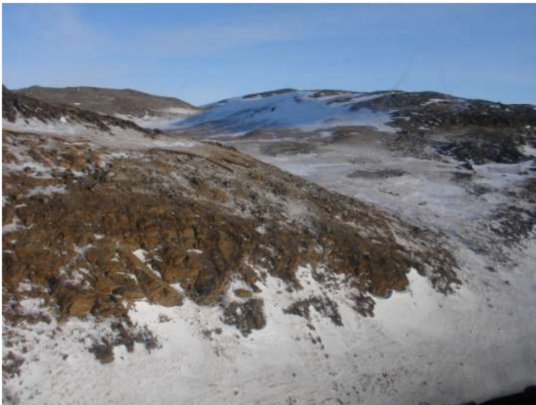
Figure 33. Transect 59, view to the NE, 4 March 2010.