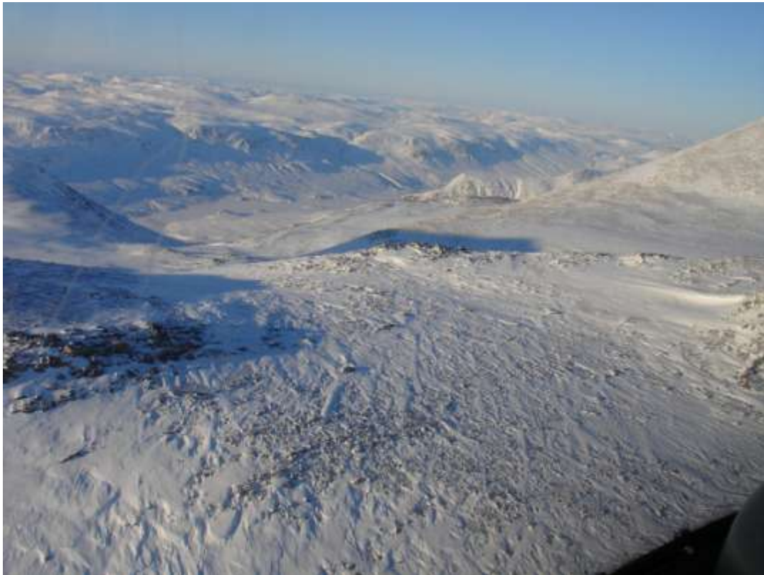
Figure 63. Transect 87, view to the WNW, 6 March 2010.