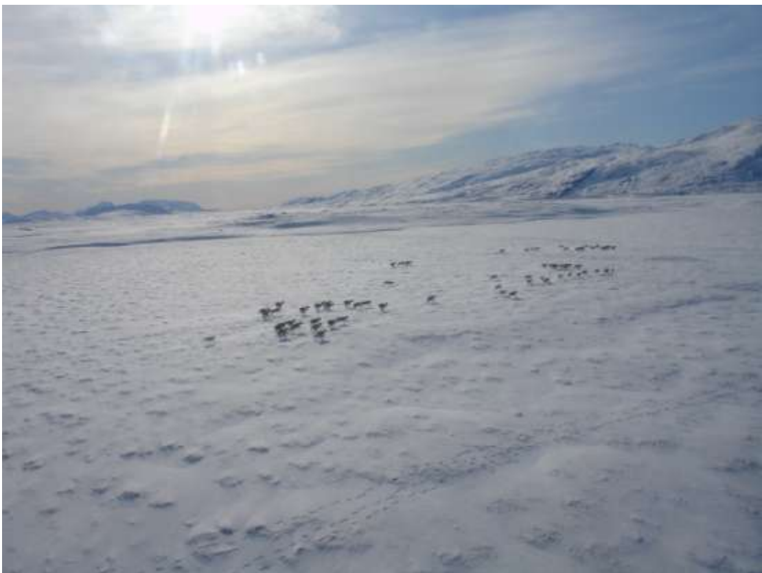
Figure 143. Closer to the caribou and in this frame there are a minimum of 74 caribou within 300 m, 12 March 2010, north end of Narssarssuaq Valley, view SSW, 12 March 2010.