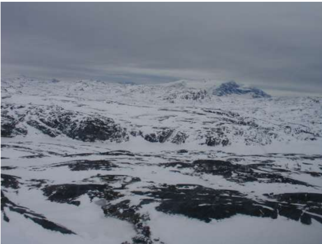
Figure 83. Transect 68, view ESE, 9 March 2010.