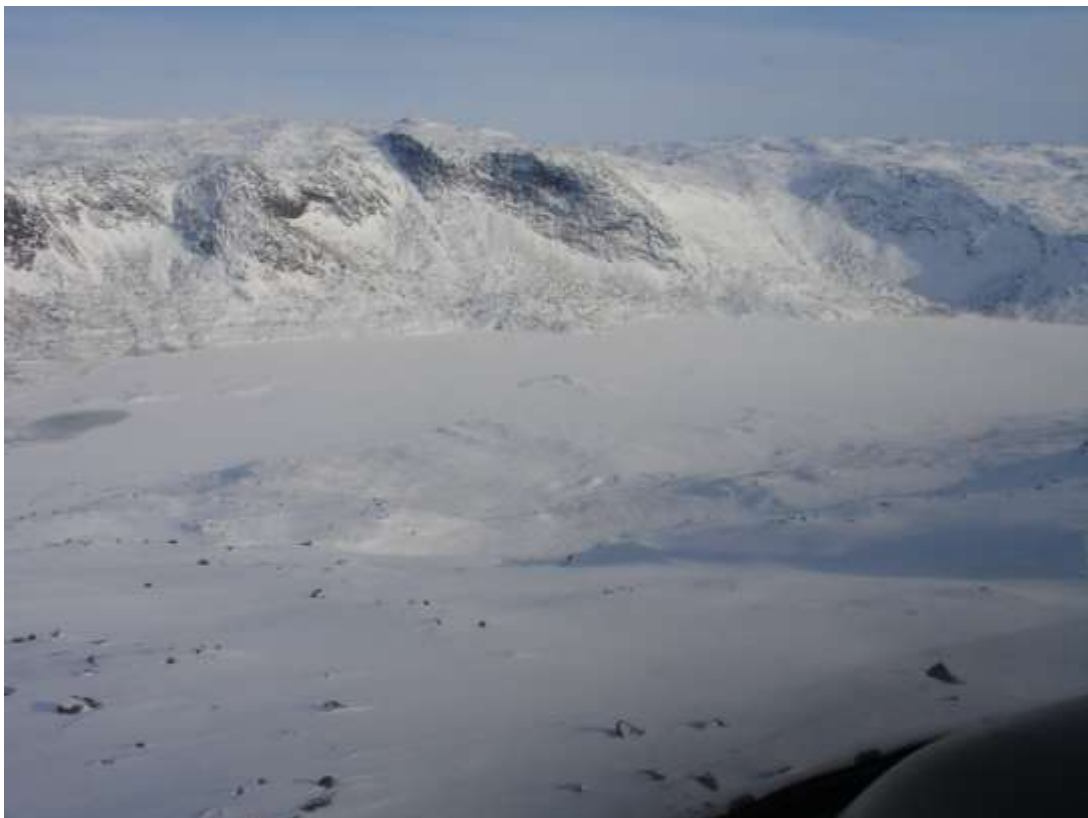
Figure 105. Transect 193, "Eldorado", view SE along zero line, 12 March 2010.