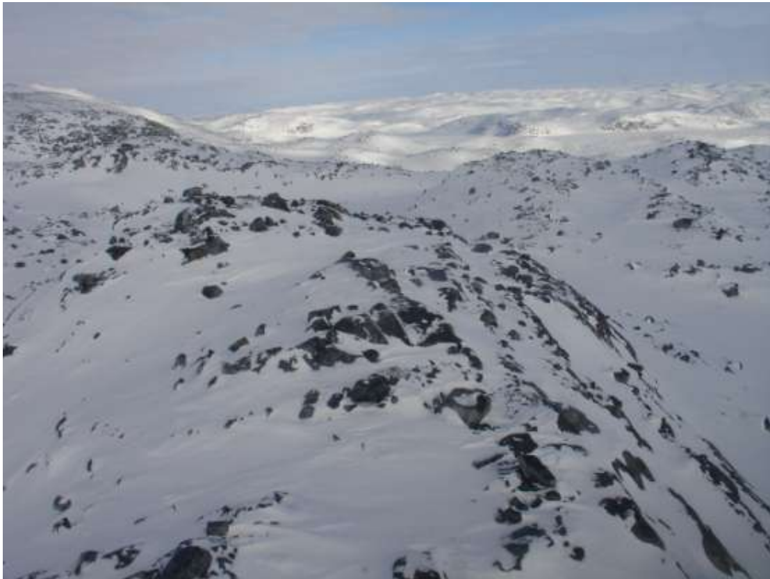
Figure 128. Transect 15, view NE, 13 March 2010.