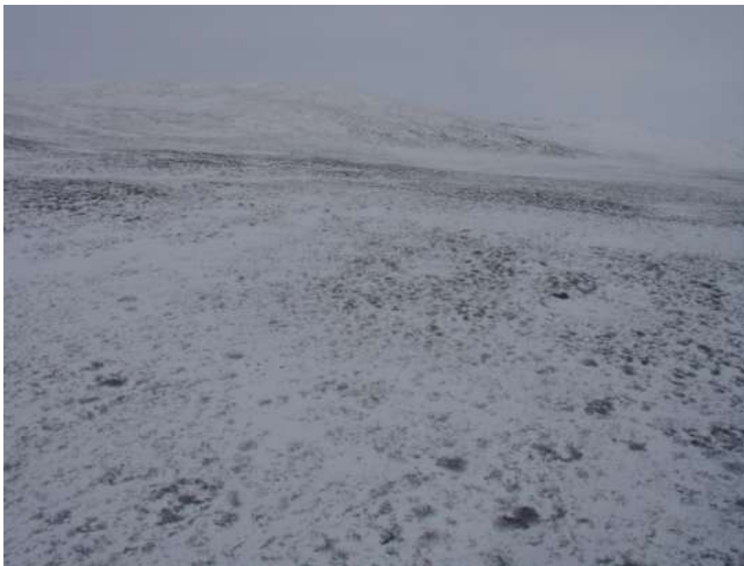
Figure 41. Transect 149, poor light, view to SW, 5 March 2010.