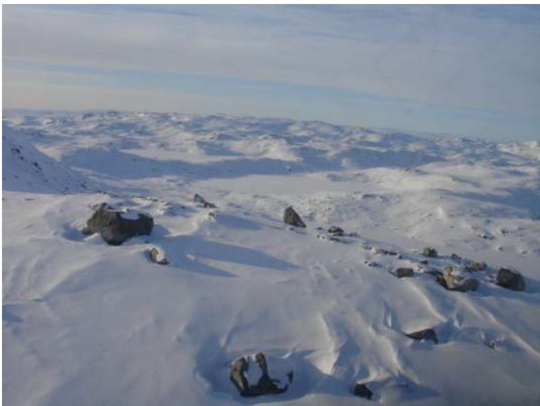
Figure 107. Transect 8, view NW, 12 March 2010.