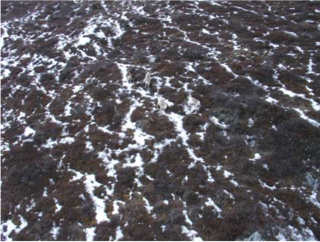
Figure 154. Four caribou < 25 m, Ilulialik, 13 March 2010.