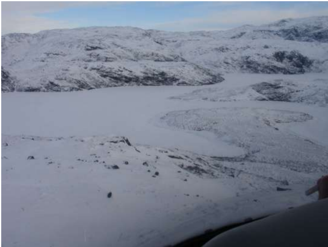
Figure 95. Transect 183, view ESE, 10 March 2010.