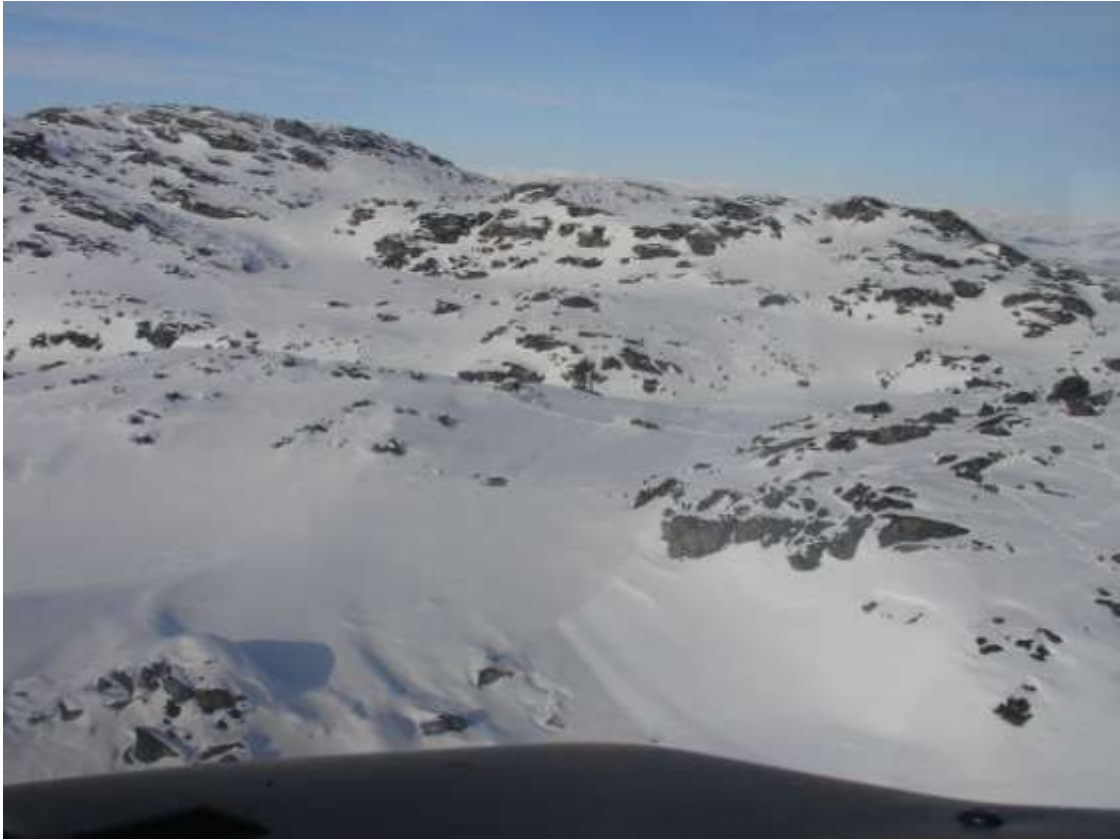
Figure 150. Three caribou on ridge ca. 175 m distant. transect 191, Akia-Maniitsoq, 12 March 2010.