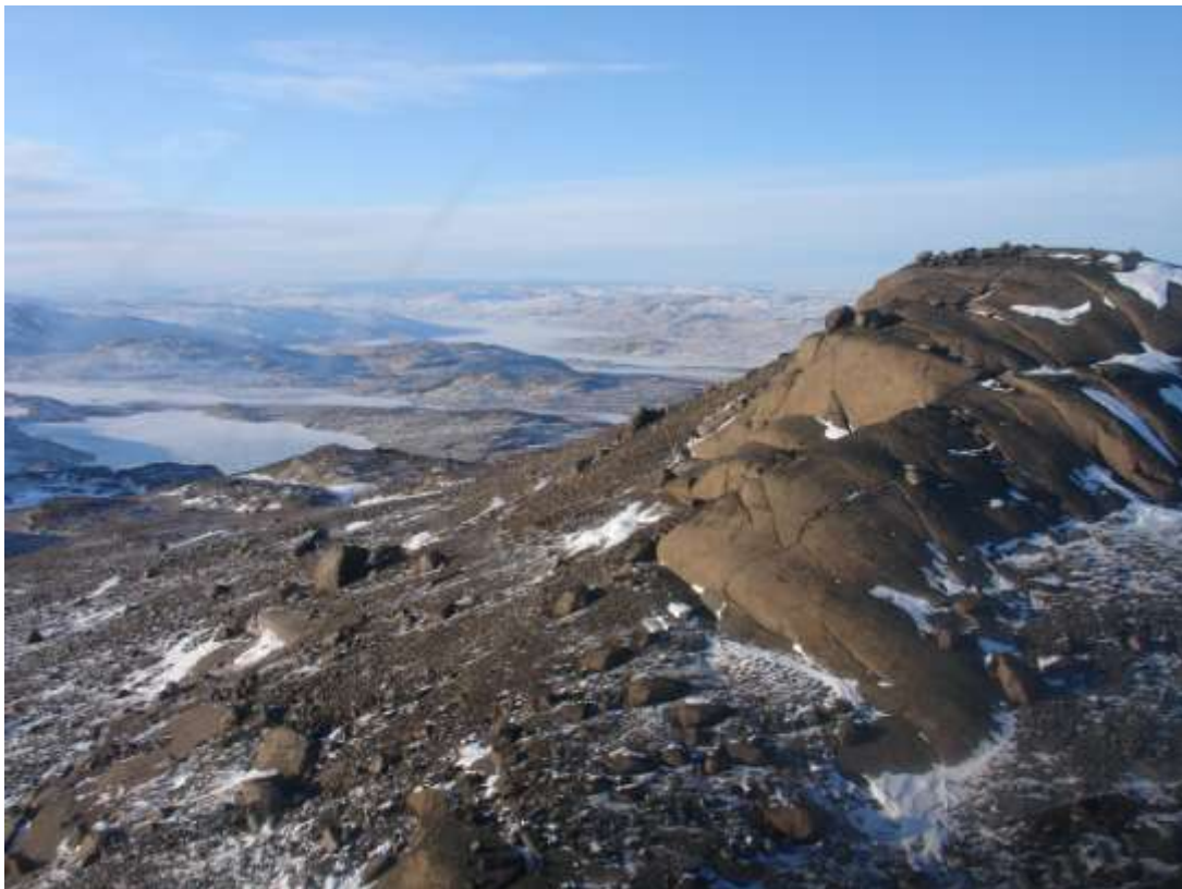
Figure 60. Transect 32, view NW as nearing north end, 3 March 2010.