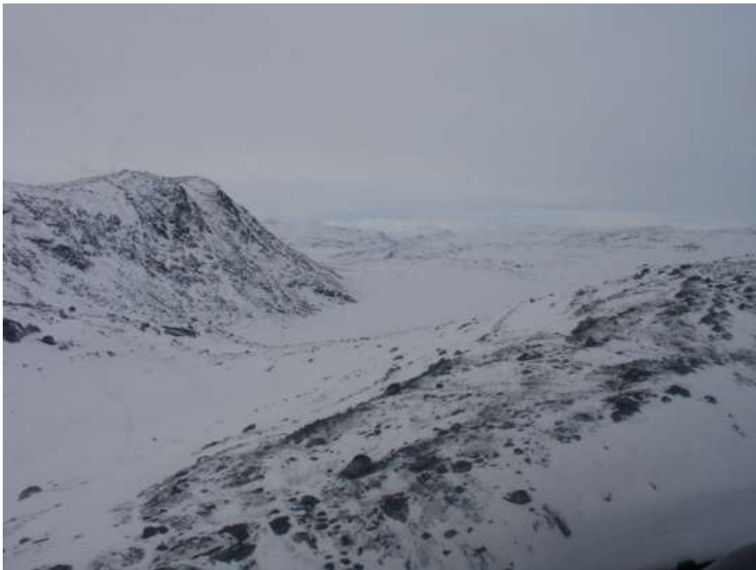
Figure 117. Transect line 126, poor light, view to the SW, 9 March.