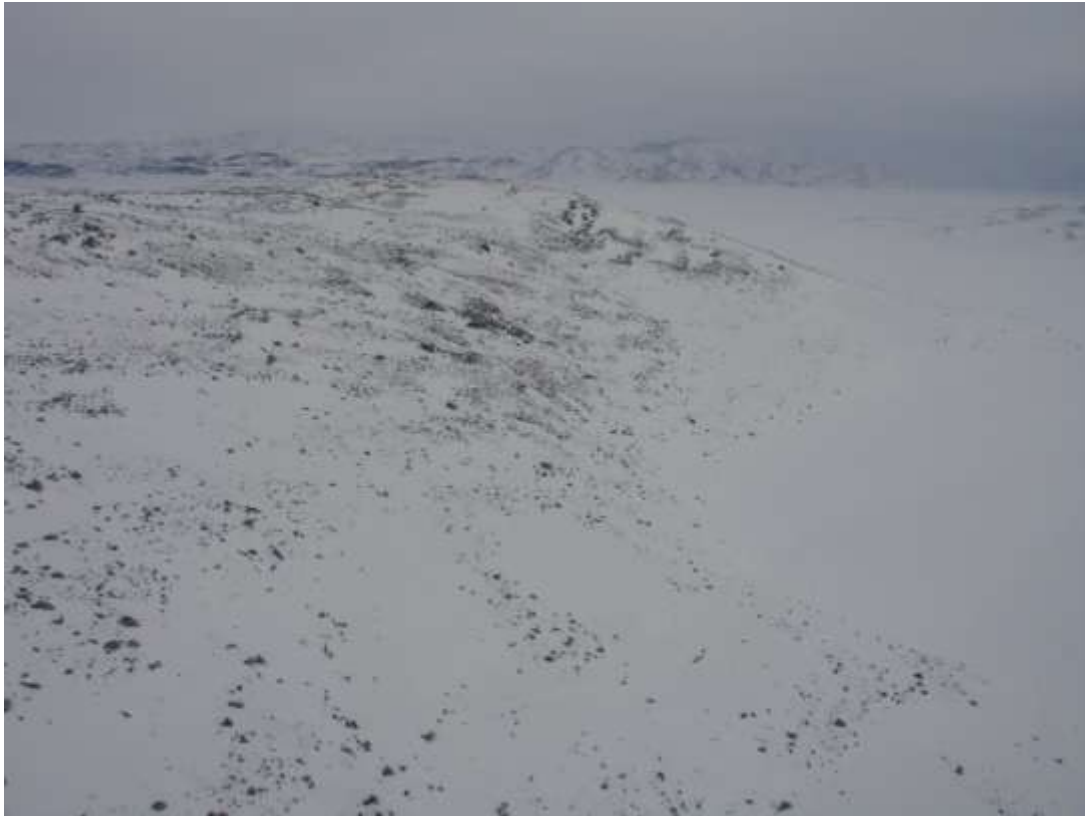
Figure 114. Transect 135, poor light, view ENE, 13 March 2010.

AM herd, Central region: High-density stratum, transects in the order flown.