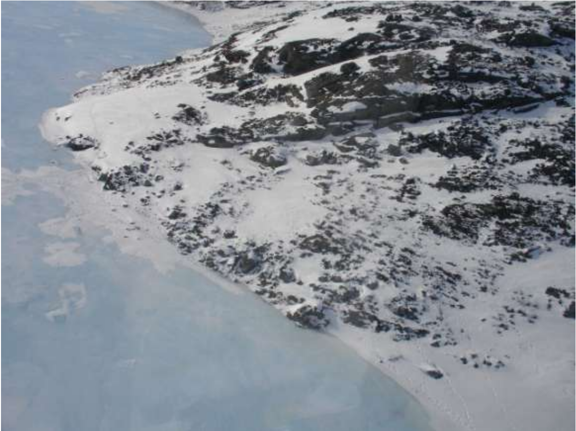
Figure 156. One caribou < 100 m, flight height ca. 50 m, 13 March 2010.