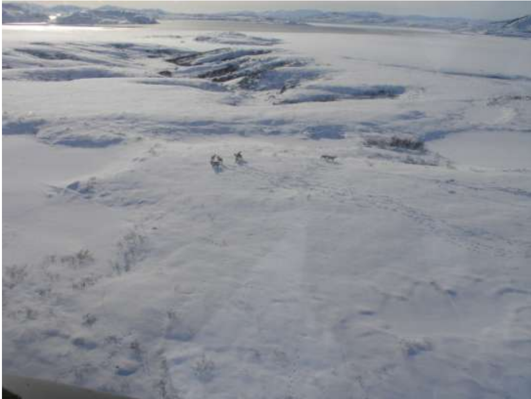
Figure 152. Nine caribou easy to see, < 150 m, at the south end of transect 21. View is to the SSW out towards Qugsuk Bay in the background. Akia-Maniitsoq, 12 March 2010.