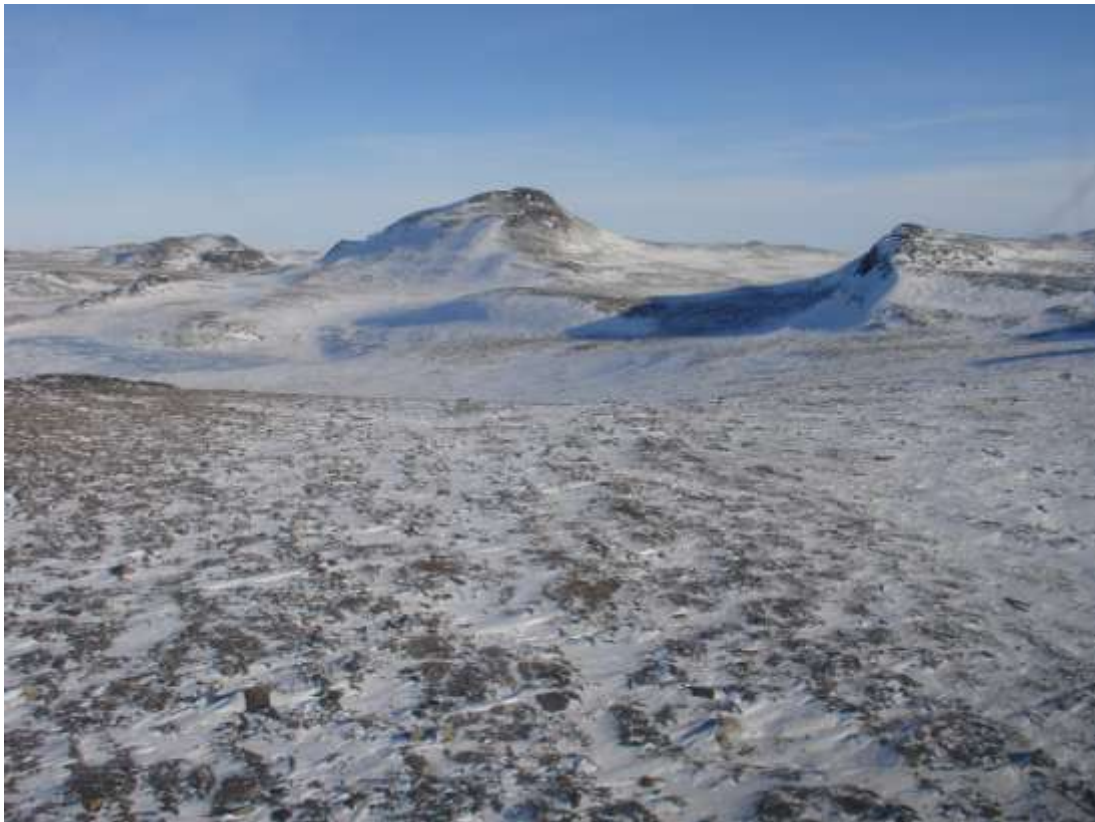
Figure 73. Transect 64, view E, 8 March 2010.