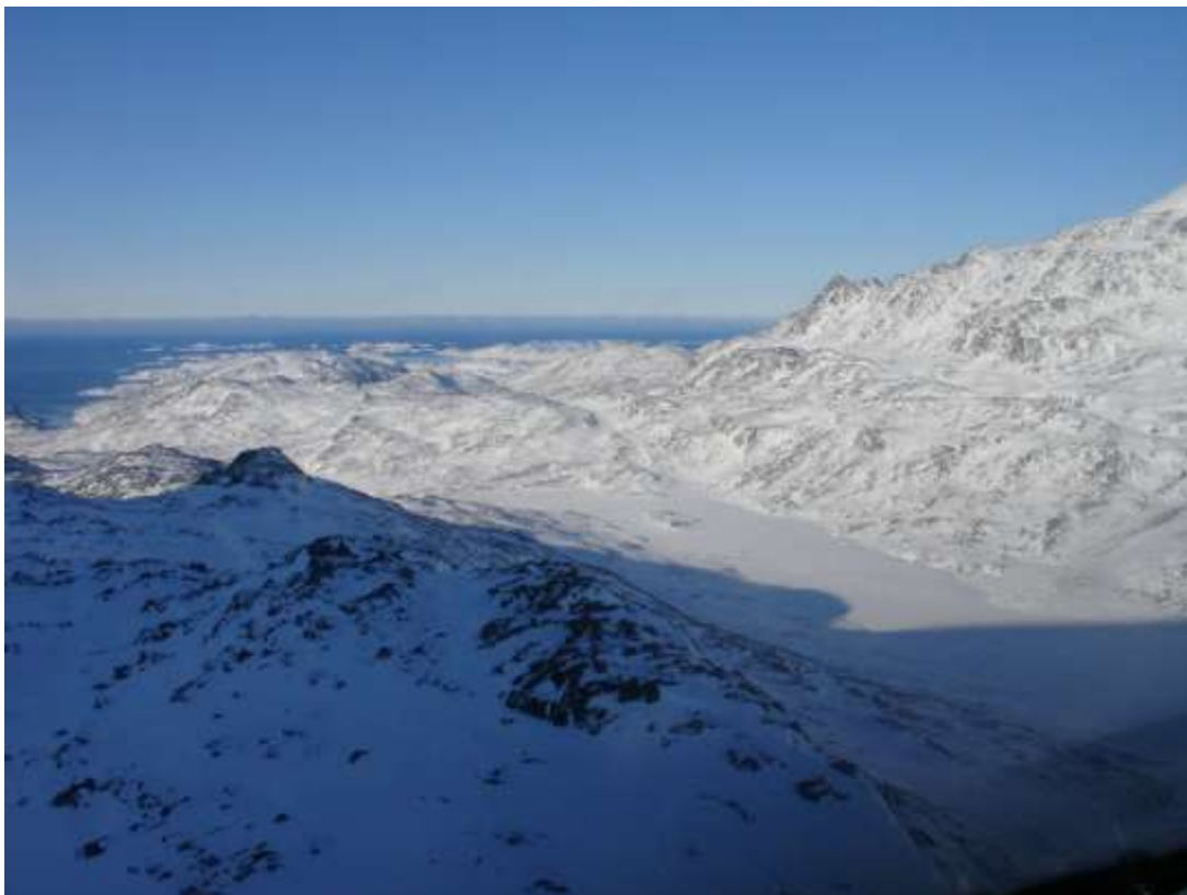
Figure 68. Transect 113, S end line, view NW, 8 March 2010.