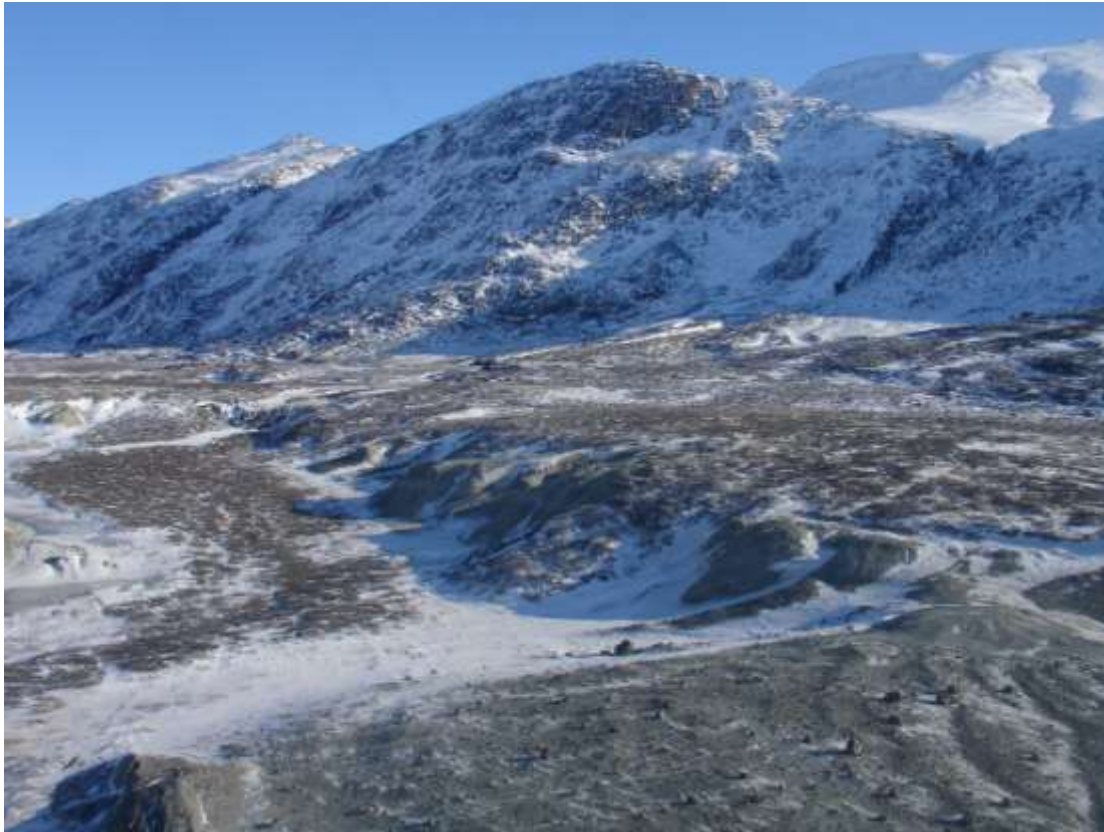
Figure 71. Transect 27, S end of line, view ENE, 8 March 2010.