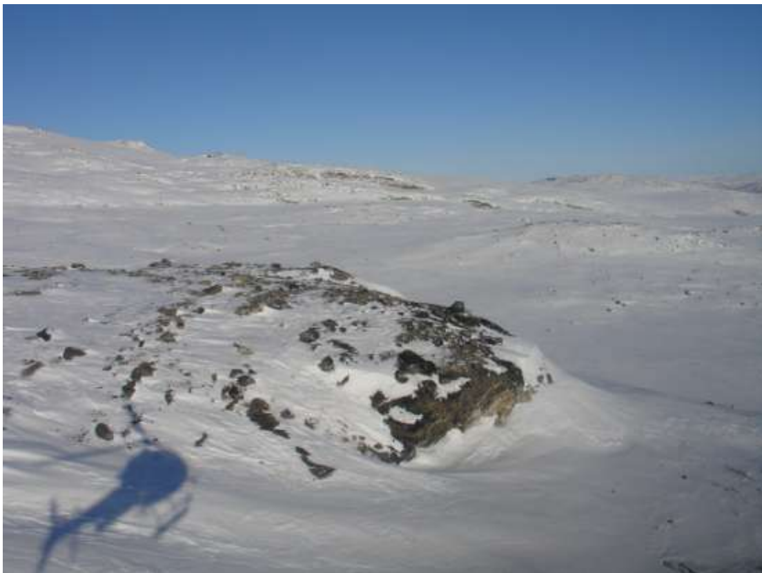
Figure 72. Transect 77, view N, 8 March 2010.