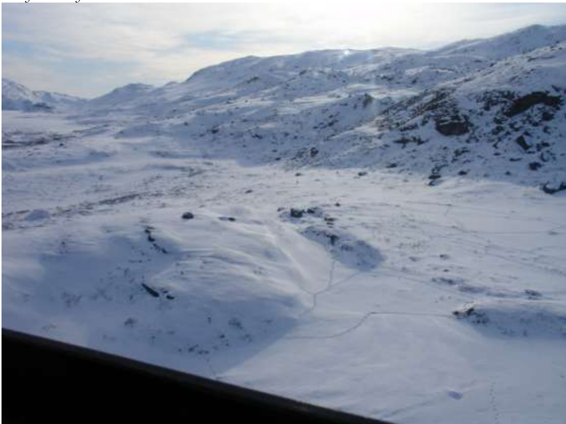
Figure 151. One caribou ca. 200 m distant, on transect 36, Eldorado valley bottom. Akia-Maniitsoq, 12 March 2010.