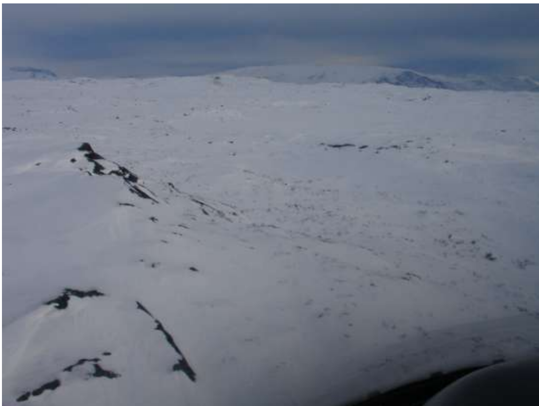
Figure 97. Transect 18, poor light, view ESE, 10 March 2010d.