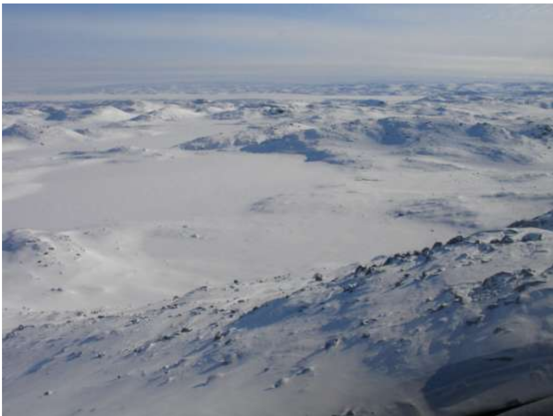
Figure 129. Transect 157, view SE, 13 March 2010.