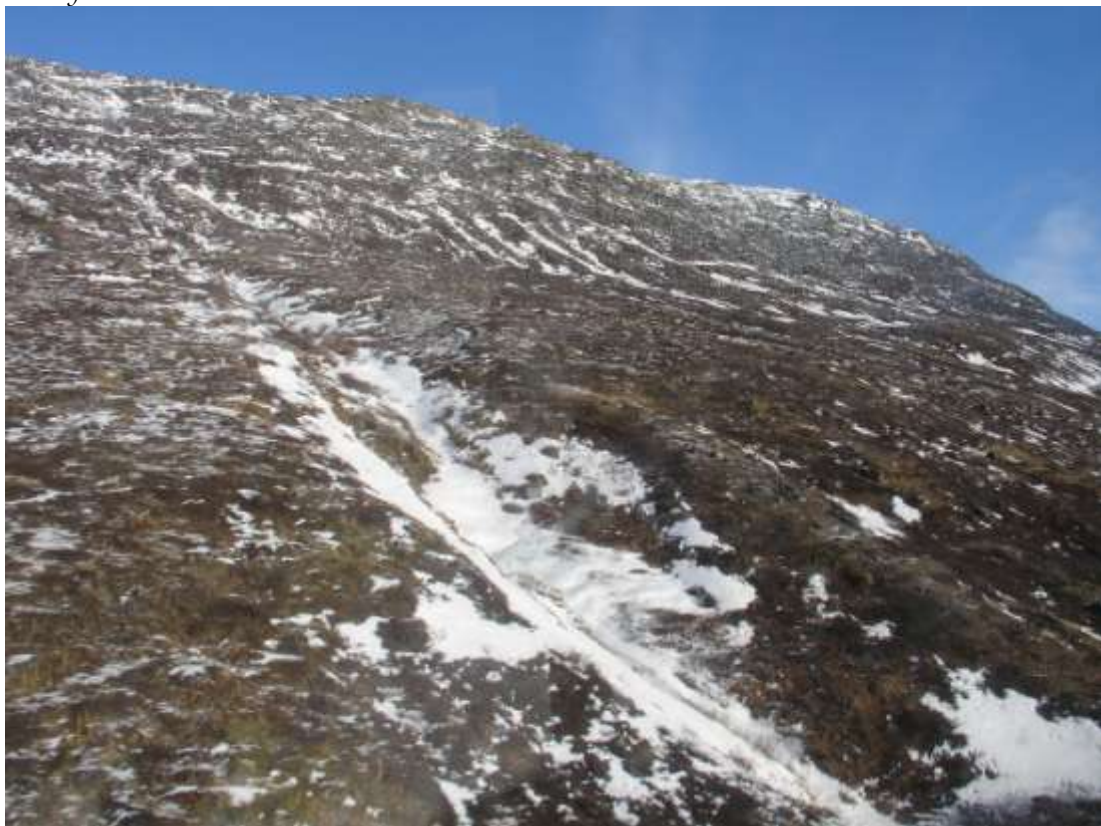
Figure 149. Seven caribou ca. 200 m distant, on north shore Godthåbsfjord, Akia-Maniitsoq, 12 March 2010.