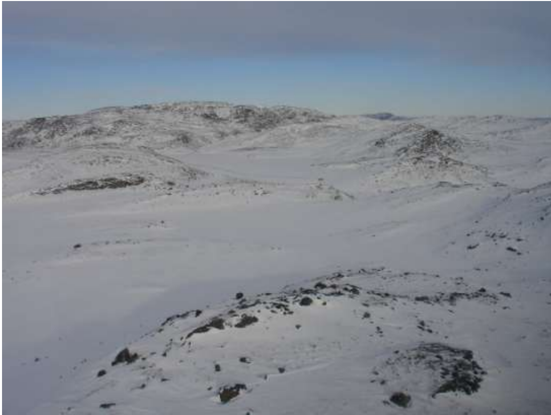
Figure 30. Transect 24, view to the ENE, 3 March 2010.