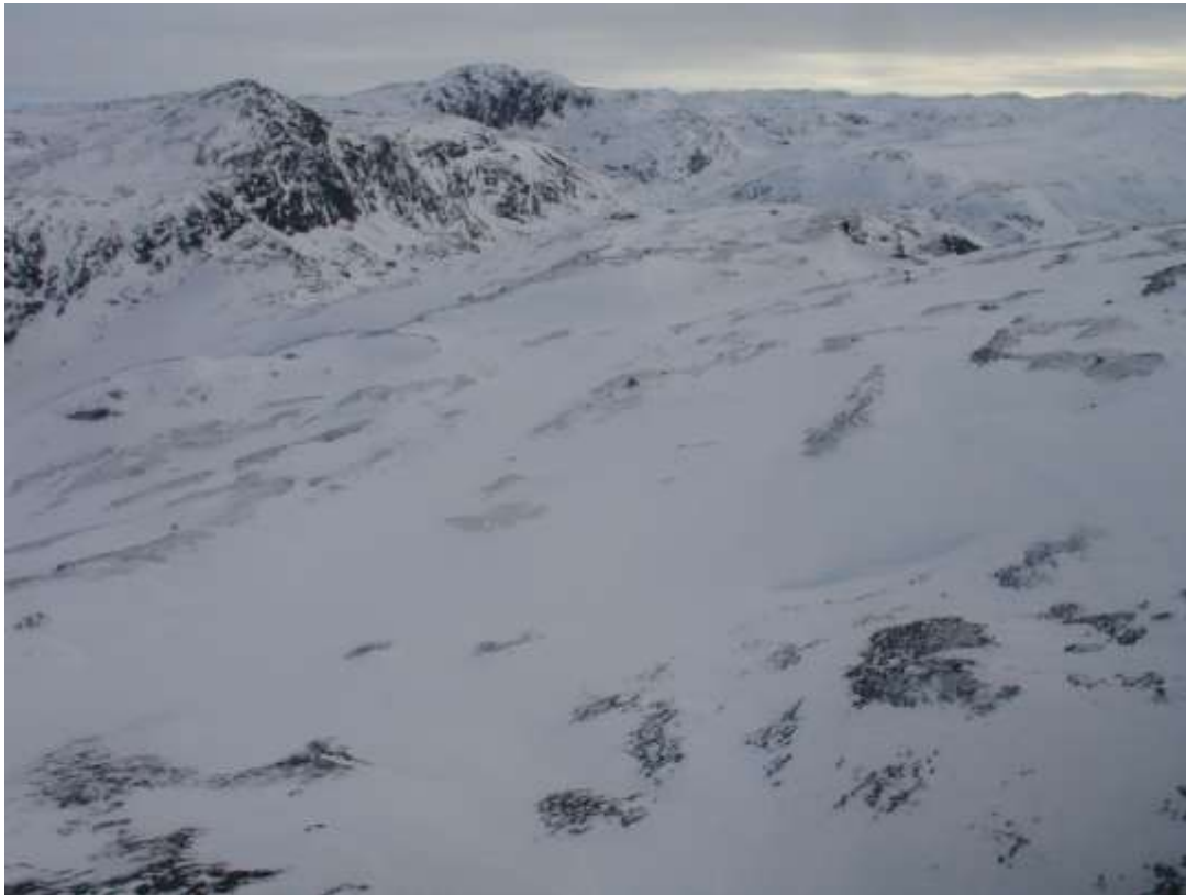
Figure 80. Transect 39, view SSW, 9 March 2010.

AM herd, Central region: High-density stratum, transects in the order flown.