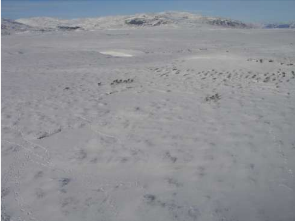
Figure 136. On the left are same group of 12 from figure 135, plus six more to their right, and minimum 35 in far background, 12 March 2010, north end of Narssarssuaq Valley.