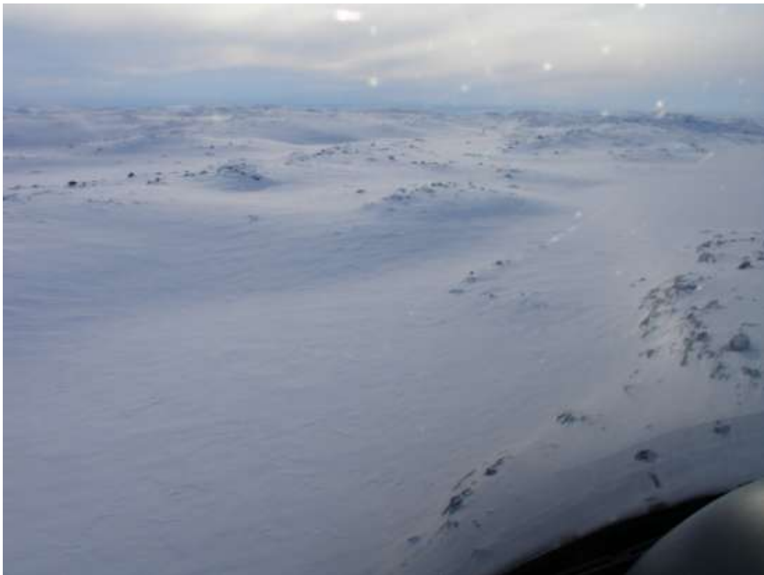
Figure 127. Transect line 61, view to SW, 10 March.