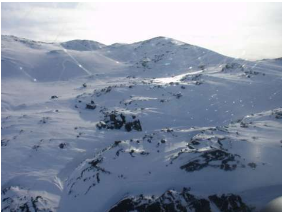
Figure 79. Transect 84 marks on windshield shown up by view to the sun; view SSW, 9 March 2010.