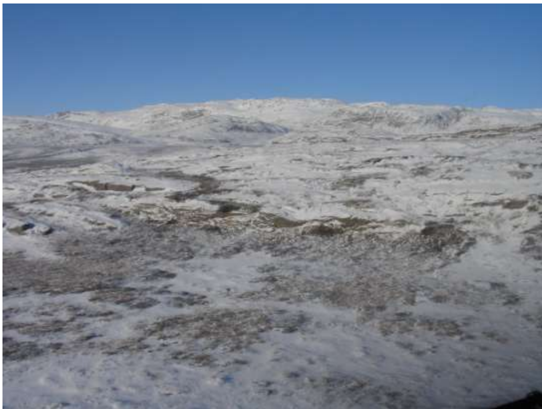
Figure 51. Transect 122, view to the NW, 6 March 2010.