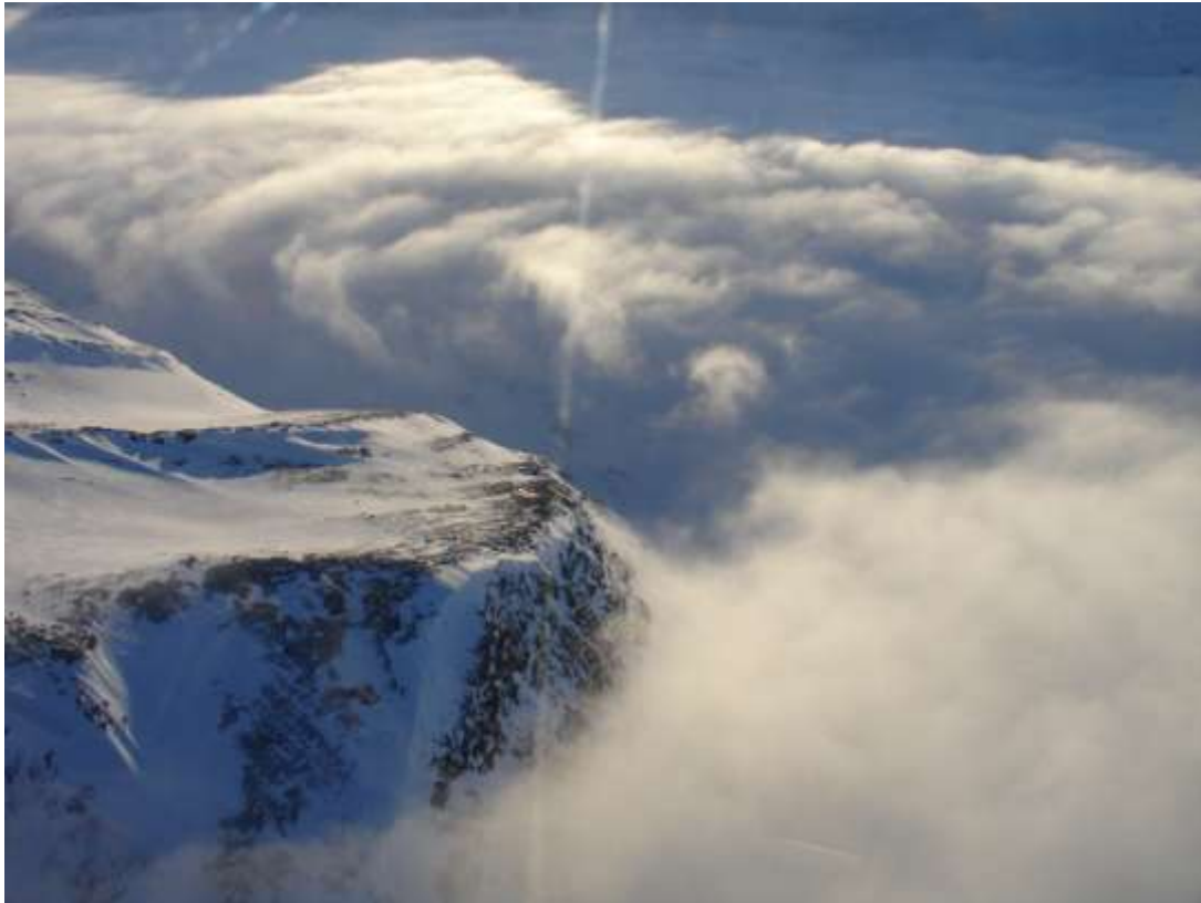
Figure 65. Transect 155, thick fog in lowlands prevented flying this line, view SE, 8 March 2010.