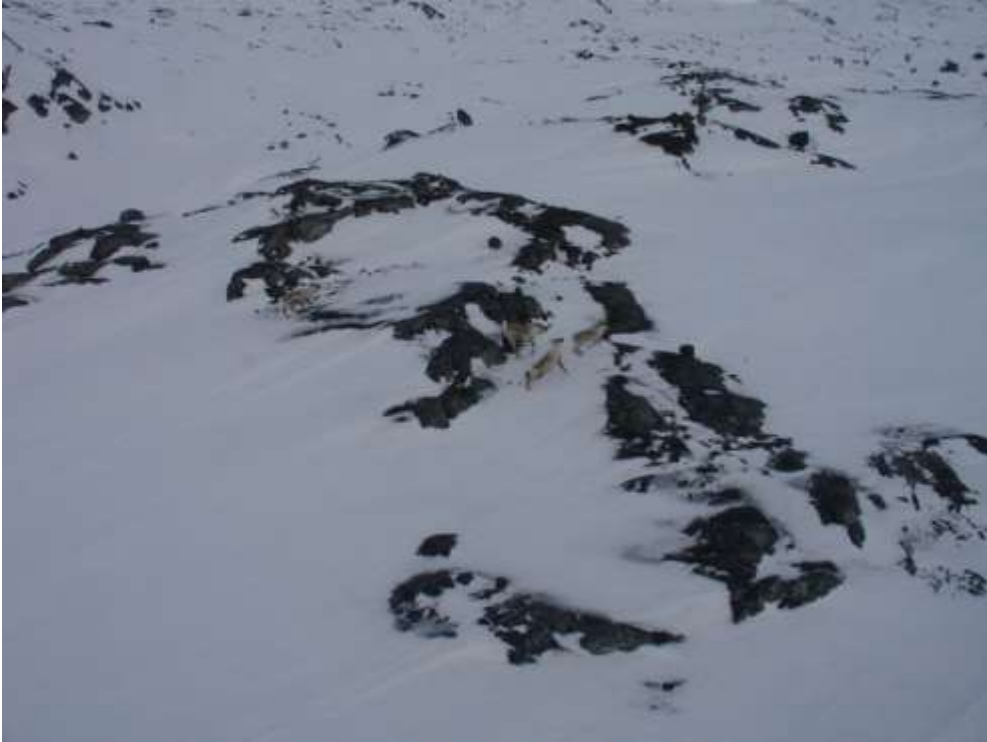
Figure 146. Four caribou <50 m, transect 1, Akia-Maniitsoq, 10 Mar 2010.

Distances are approximate and in metres from the transect's "zero-line" on the ground.