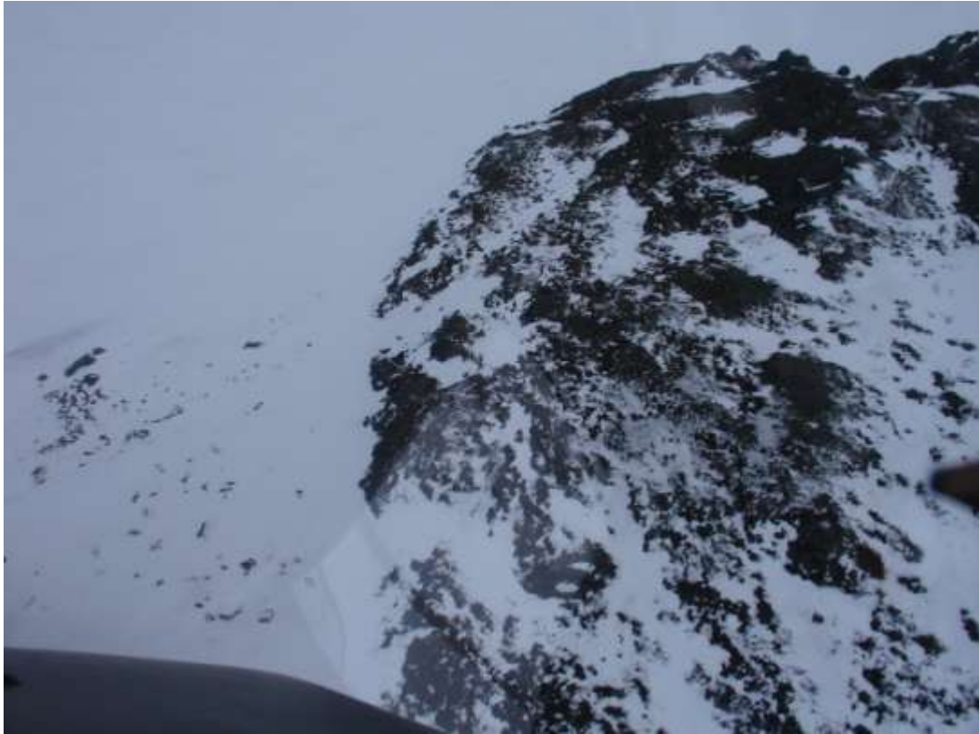
Figure 148. Three caribou just standing, ca. 25 m, transect 18, Akia-Maniitsoq, March 2010.