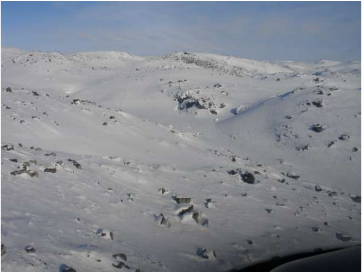
Figure 130. Transect 96, view NE, 13 March 2010.