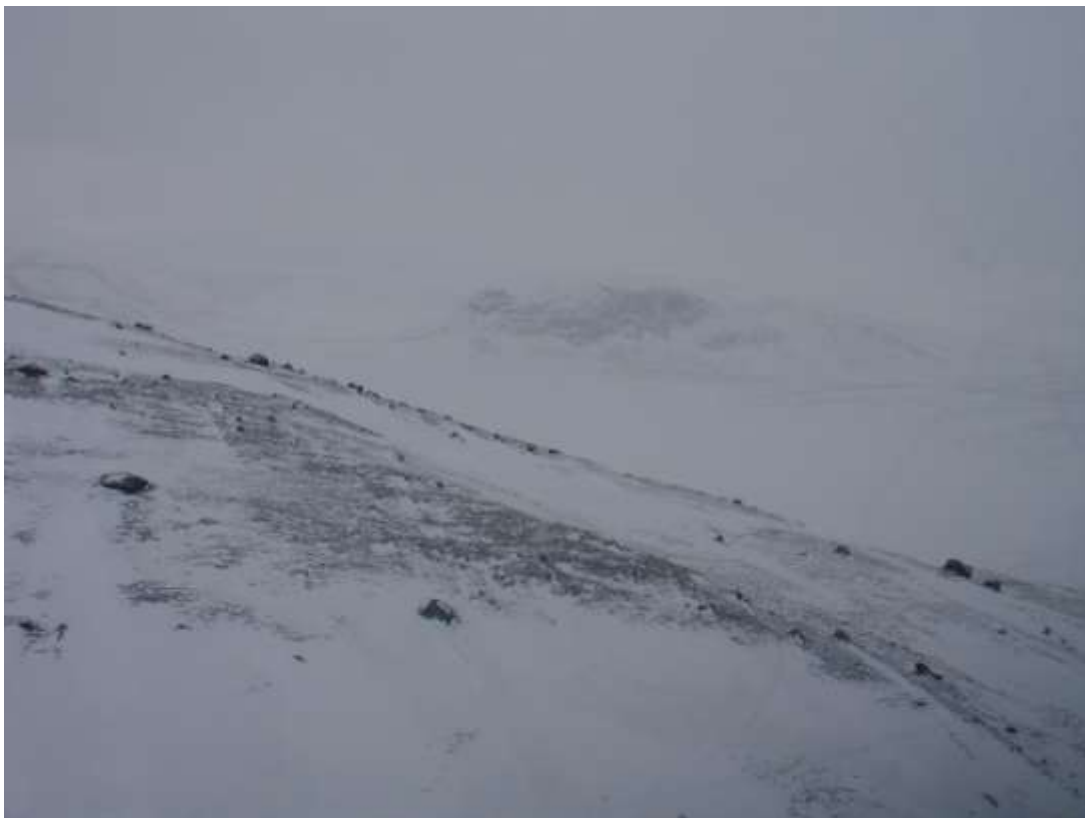
Figure 37. Transect 106, view to the SW, poor light & foggy, 4 March 2010.