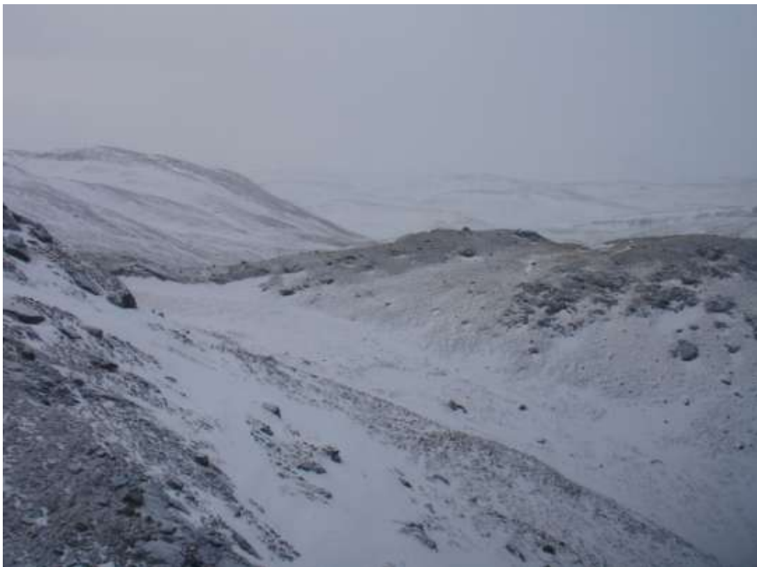
Figure 39. Transect 36, view to the NNW, poor light & foggy, 4 March 2010.