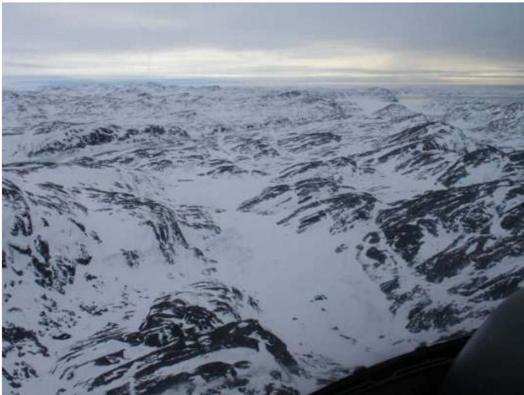
Figure 81. Transect 17, view SSW, 9 March 2010.