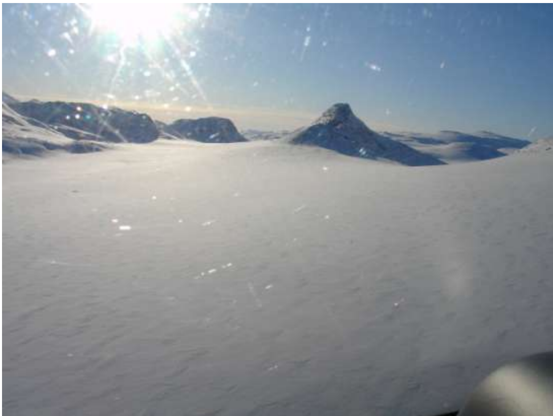
Figure 62. Transect 29, view to the SE, 6 March 2010.