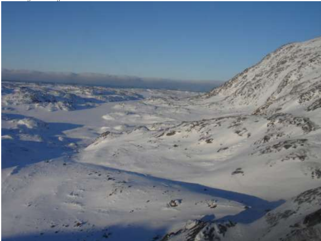
Figure 66. Transect 47, E end of line, view WNW, 8 March 2010.