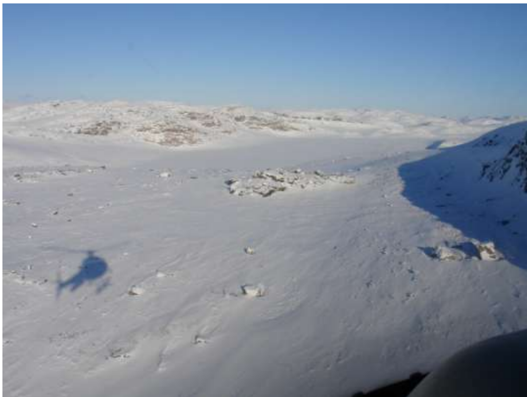
Figure 52. Transect 76, view to the ENE, 6 March 2010.

KS Herd North region: High-density stratum, transects in the order flown.