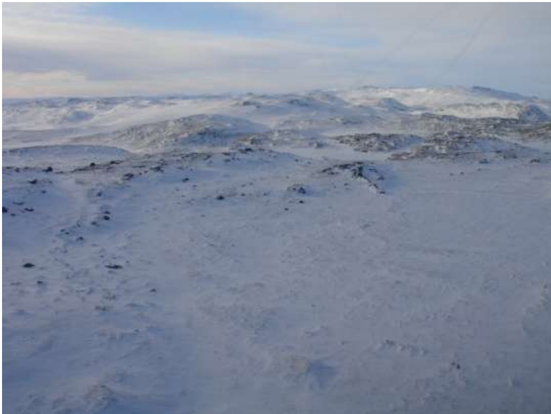
Figure 24. Transect 183, view to the W, 3 March 2010.

KS Herd North region: High-density stratum, transects in the order flown.