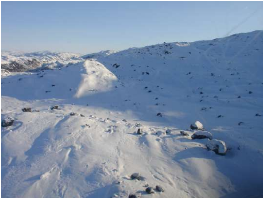
Figure 87. Transect 87, which is just E of Olive mine, view ENE, 10 March 2010.