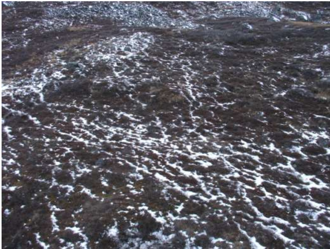
Figure 133. Two caribou ca. 100 m (upper centre); one to the left and to the right a cow (blends into background) with an orange Telonics satellite collar, Ilulialik, 13 March 2010.