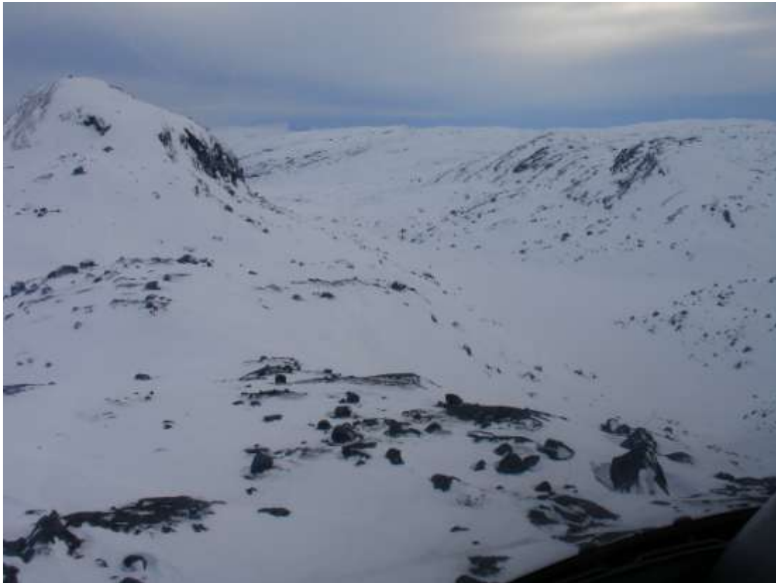
Figure 96. Transect 1, poor light, view S, 10 March 2010.

AM herd, Central region: High-density stratum, transects in the order flown.