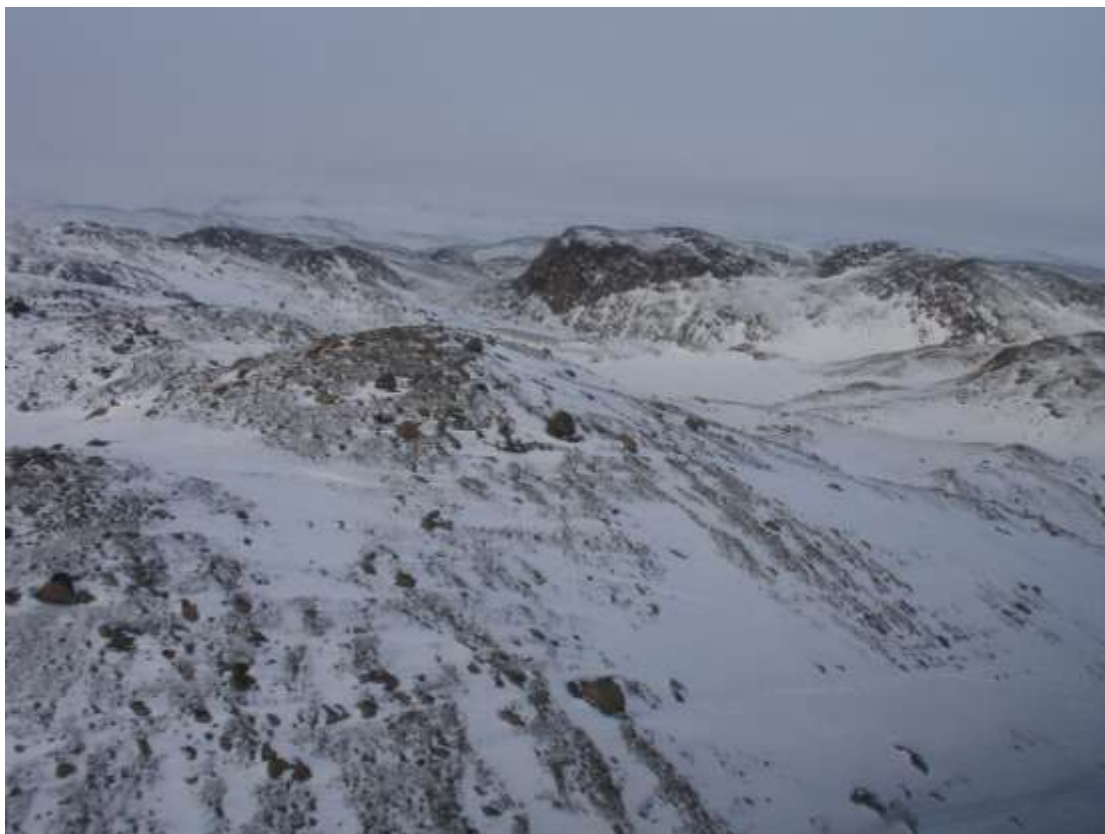
Figure 34. Transect 70, poor light, view NNW, 4 March 2010.