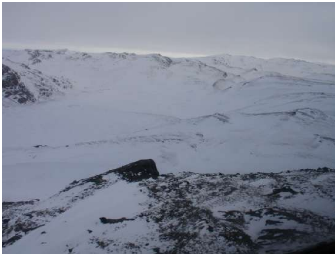
Figure 35. Transect 142, poor light, view to the SSE, 4 March 2010.