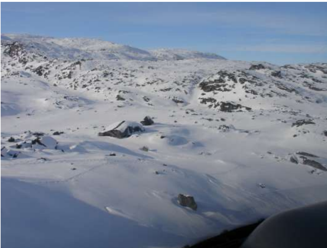
Figure 103. Transect 191, E end, view W, 12 March 2010.