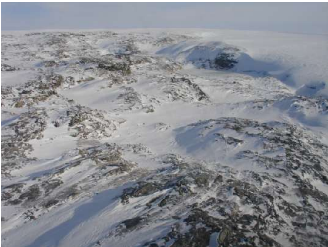
Figure 99. Transect 64, the E end at Ice Cap, view E, 12 March 2010.