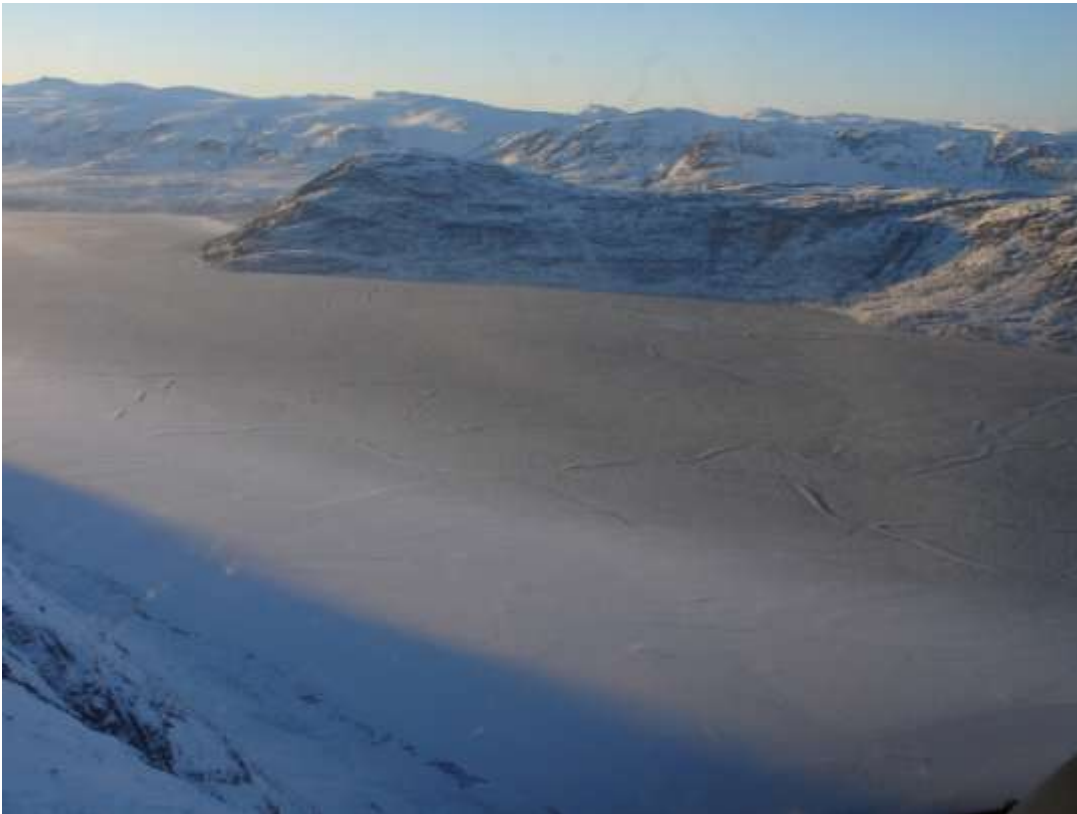
Figure 58. Transect 139, wide Isortoq River valley covered in windblown loess dirt, view to the NW, 6 March 2010.

KS Herd North region: High-density stratum, transects in the order flown.