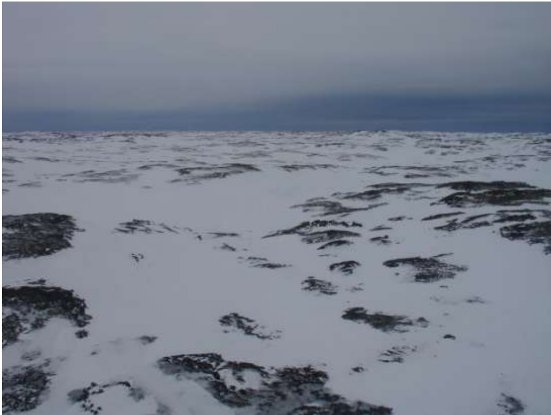
Figure 84. Transect 77, Akia lowlands, view SW, 9 March 2010.

AM herd, Central region: High-density stratum, transects in the order flown.