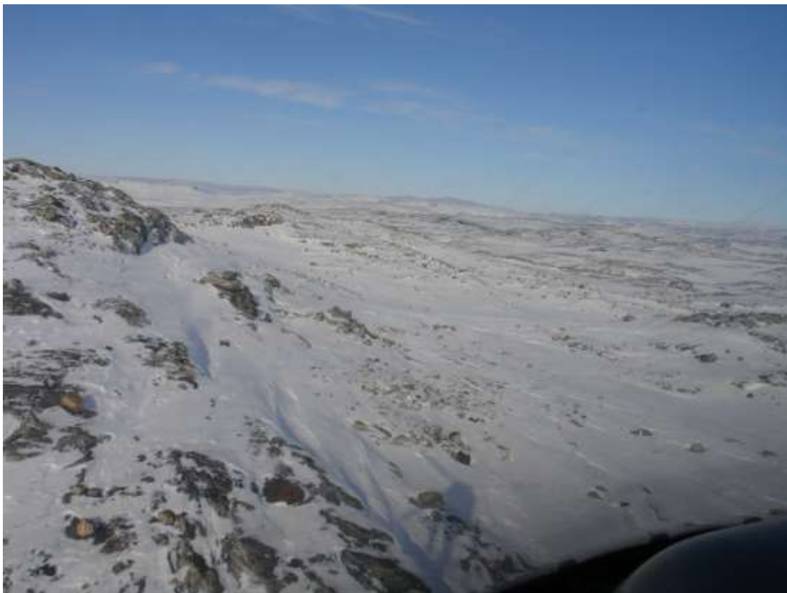
Figure 101. Transect 166, view NW, 12 March 2010.