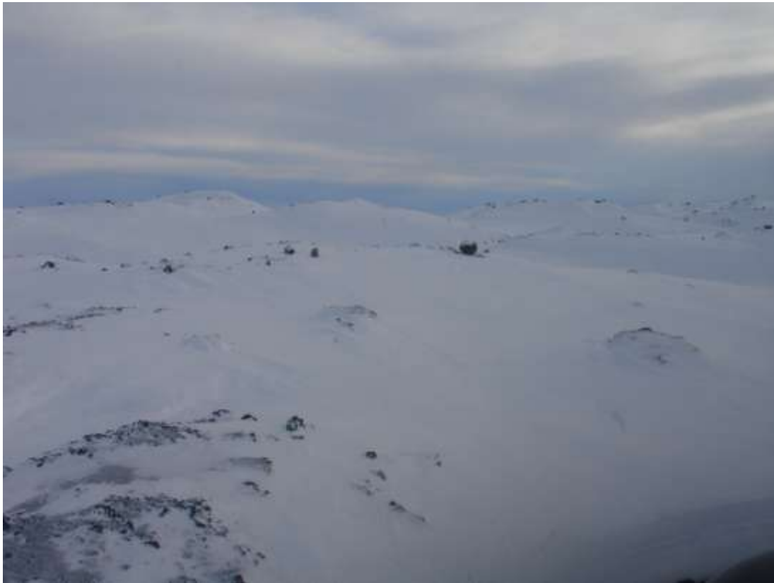
Figure 94. Transect 3, poor light, view SSE, 10 March 2010.

AM herd, Central region: High-density stratum, transects in the order flown.