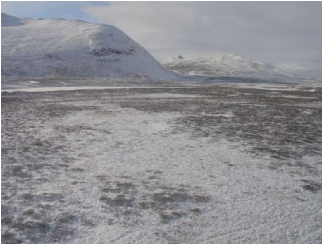
Figure 44. Transect 189, view to the NW, 5 March 2010.

KS Herd North region: High-density stratum, transects in the order flown.