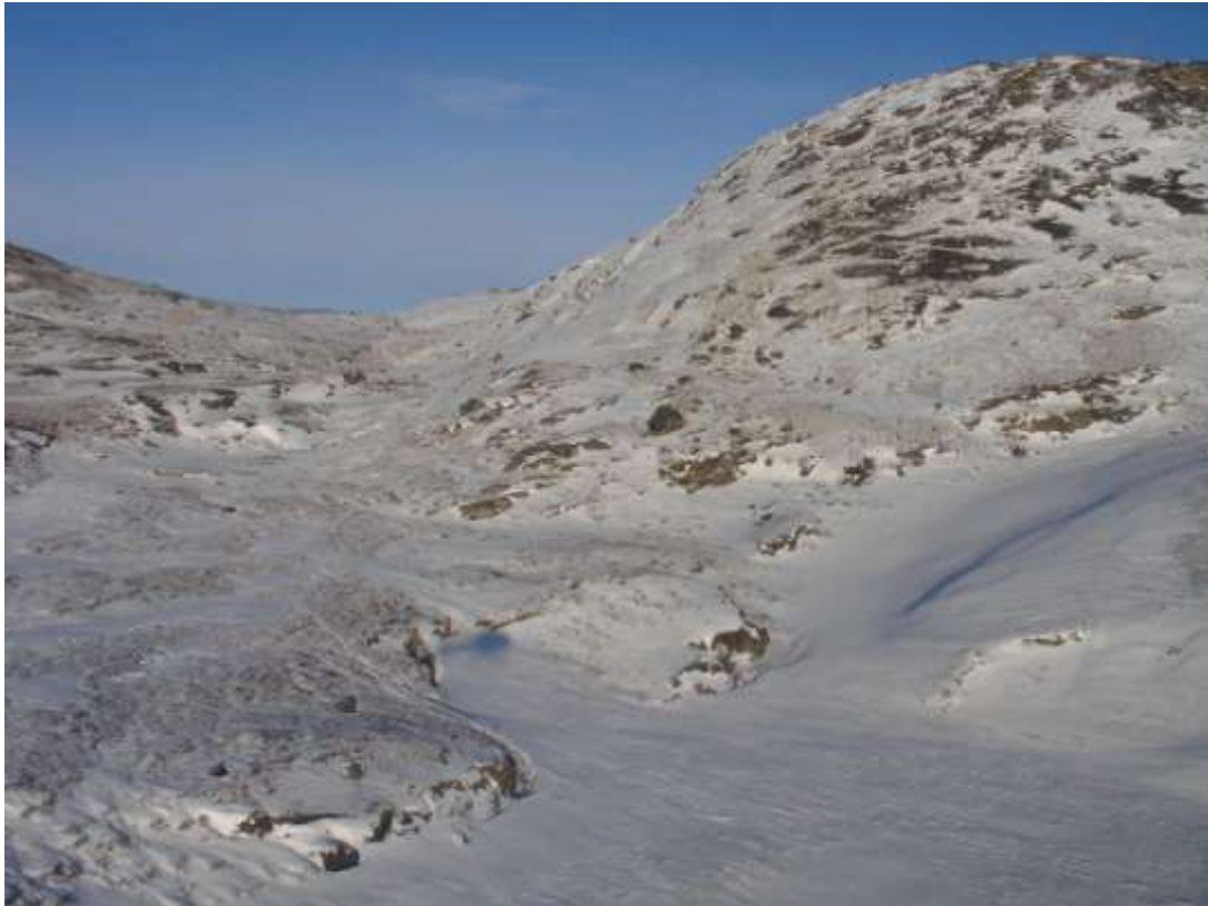
Figure 59. Transect 125, view to the E, 3 March 2010.