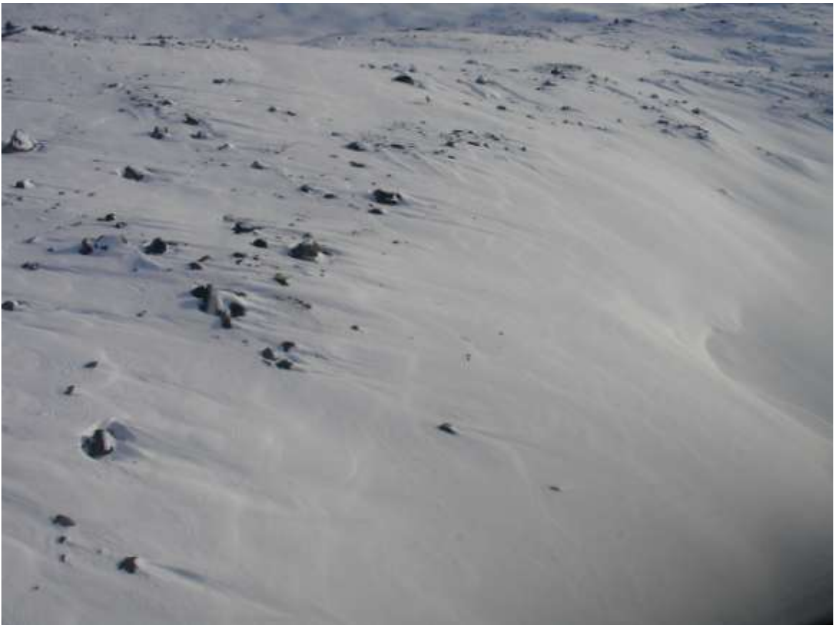
Figure 157. One caribou < 200 m, 13 March 2010.