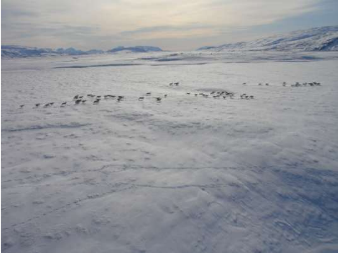
Figure 144. Closer to the same caribou in this frame, there are minimum 78 caribou within 200 m, 12 March 2010, north end of Narssarssuaq Valley, view south, 12 March 2010.