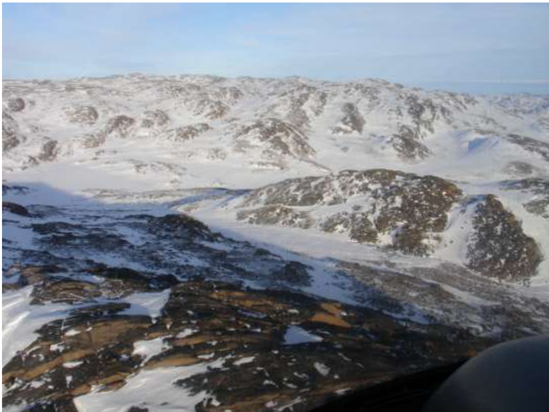
Figure 74. Transect 150, view E, 8 March 2010.