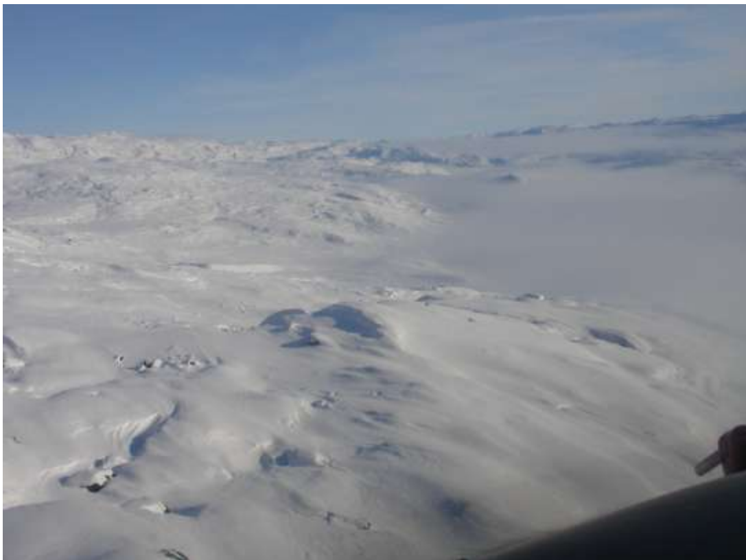
Figure 123. Transect line 155, view to SE with line ending in fog, 10 March.