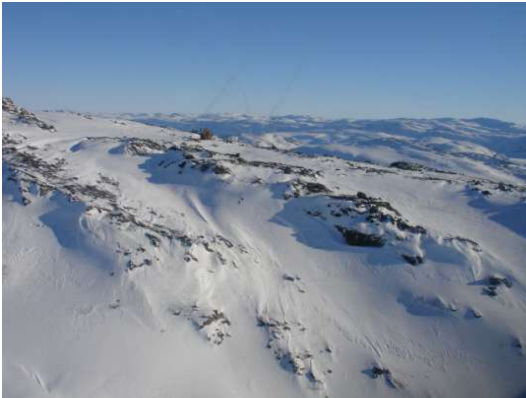
Figure 54. Transect 202, view to the NE, 6 March 2010.