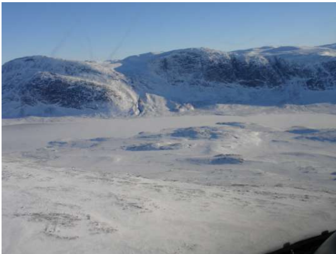
Figure 57. Transect 120, view to the SE, 6 March 2010.