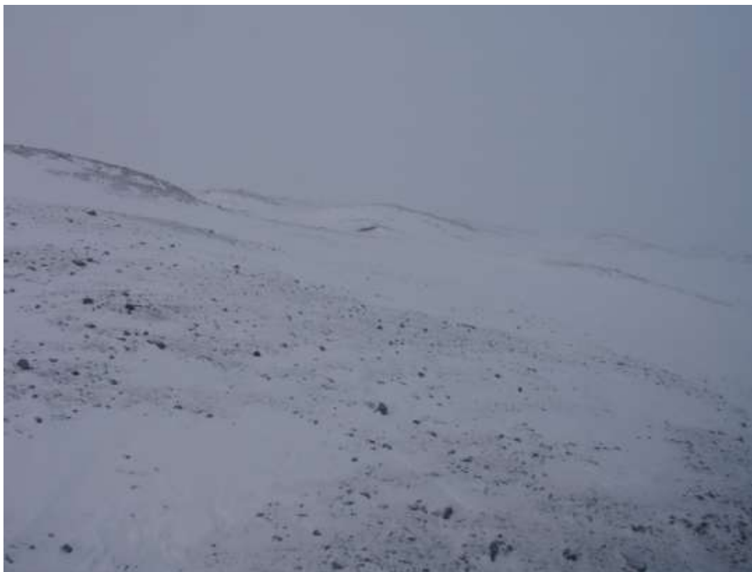
Figure 40. Transect 137, view to the NNW, poor light & foggy, 4 March 2010.