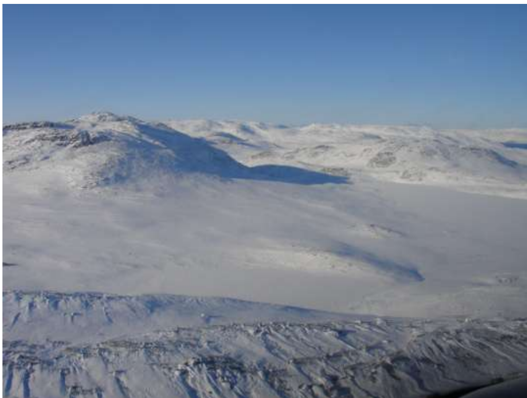
Figure 53. Transect 115, view to the WSW, 6 March 2010.