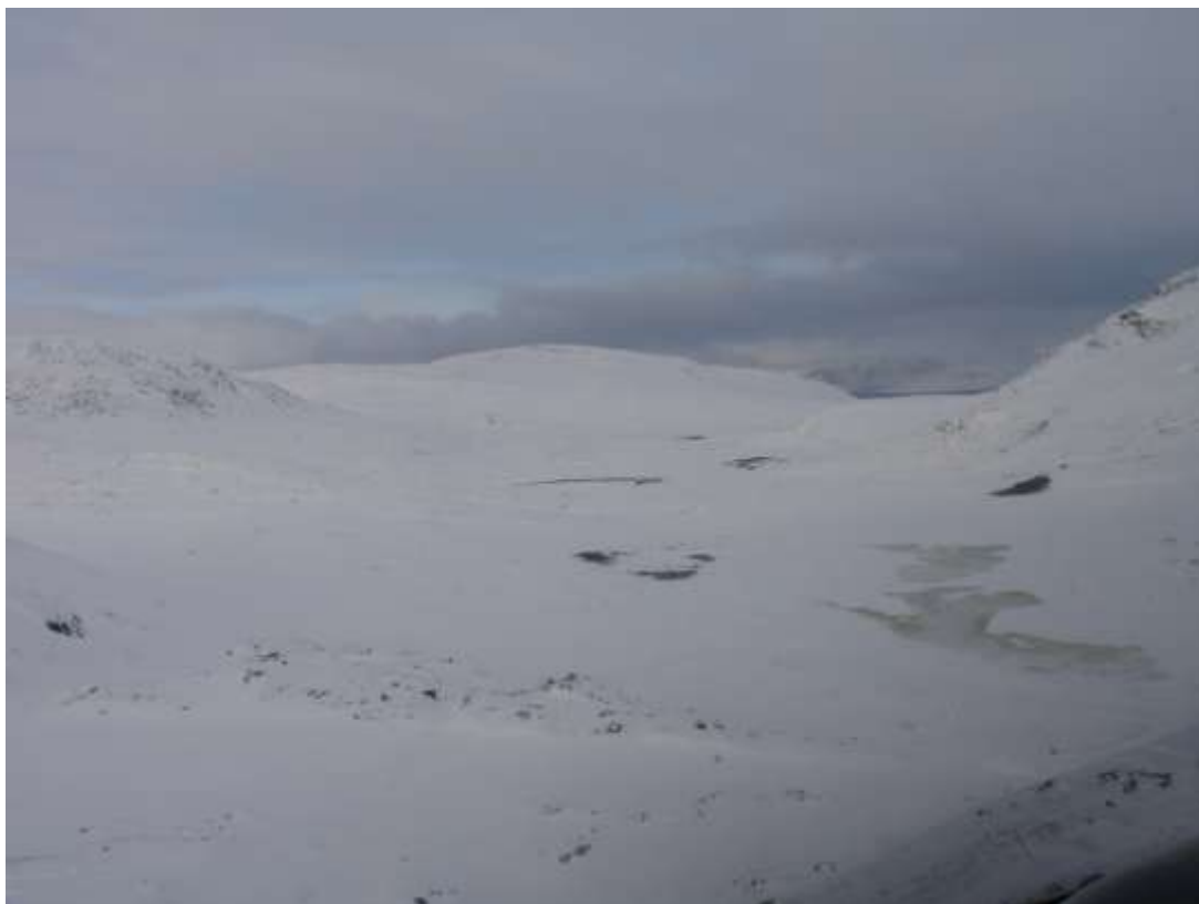
Figure 46. Transect 210, view to the N, 5 March 2010.