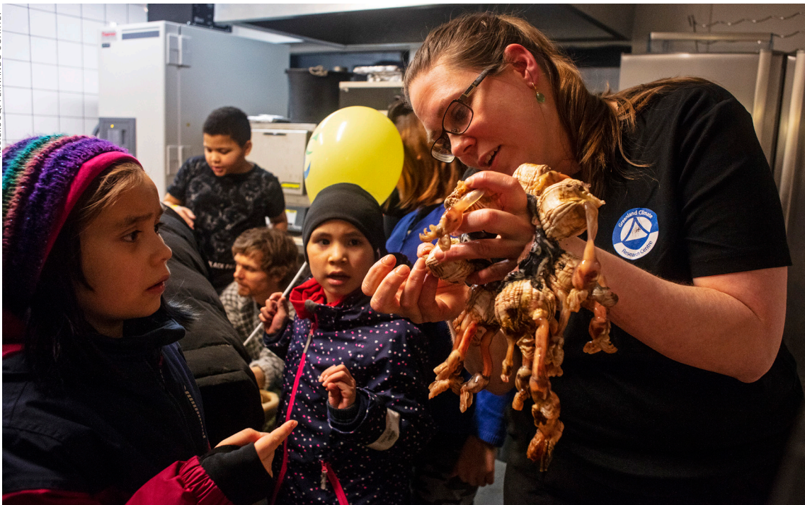
Mie S.Winding kaattungiat qipoqqameersut niivirsiaqqamut tupigusuppaseqisumut takutikkai.