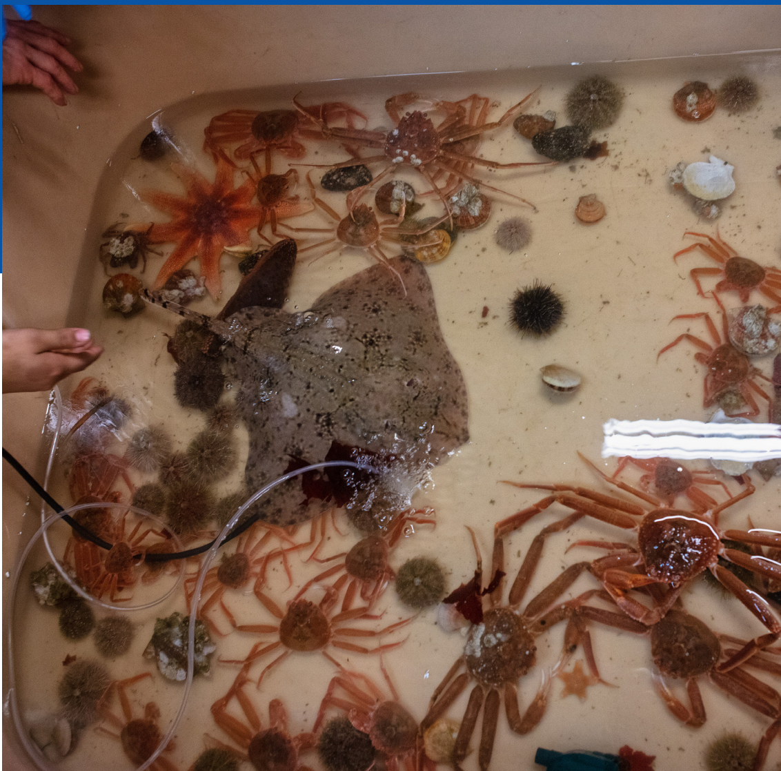
Immap naqqani aalasualuit Unnuk Kulurisiorfik 2019-imi takussat ilagaat.