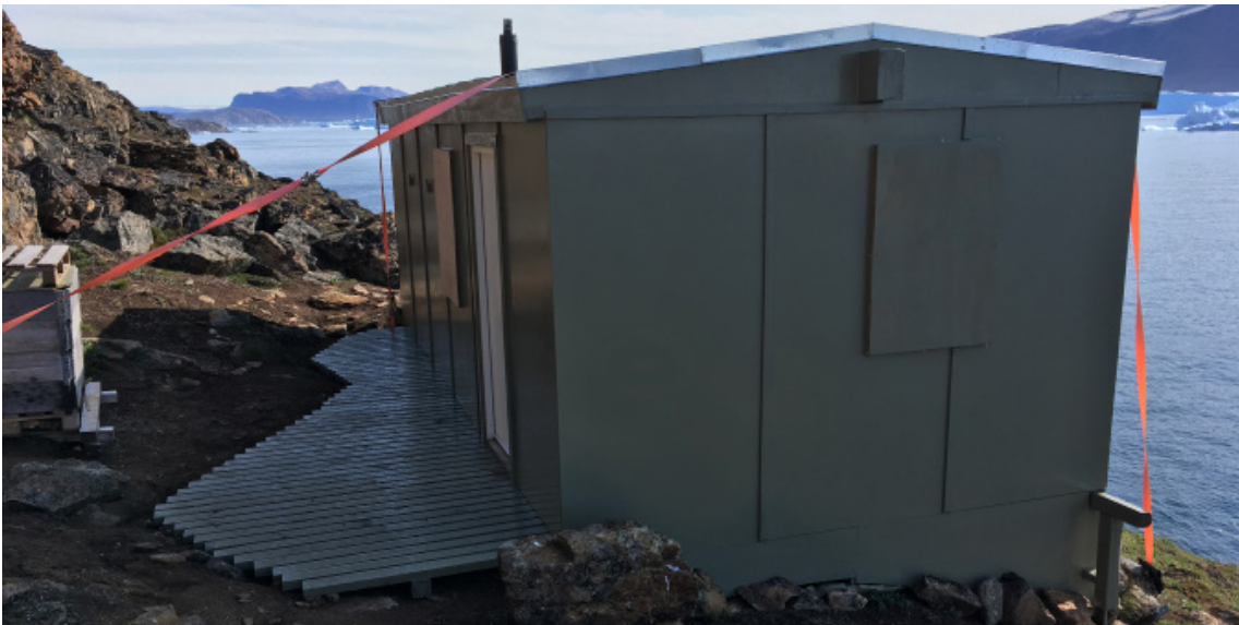
Upernaviup eqqaani Kippakumi illuut.