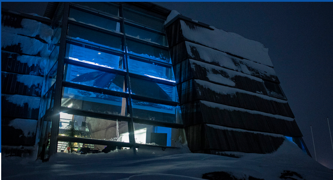
Pinngortitaleriffik Unnuk Kulturisiorfik 2019-imut piareeqqasoq.