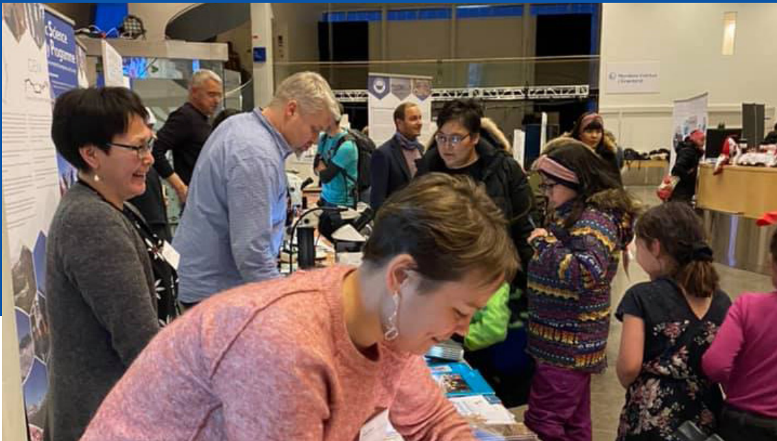
Silap Pissusianik Ilisimatusarfik 2019-imi ukiunik qulinngortorsiorluni nalliuttorsiorpoq. Ilaatigut februaarip 16-iani Katuami sulap pissusianik ullorsioirtitsilluni.

sutsikkut siunnersuisarnerit akisussaaffigai. Nuup Kangerluani timmissanik imarmiunik arfernillu misissuisarnerit kingunerisaannik suliassanut silap pissusianik malinnaaffiginninnermut attuumasut ilinnut immikkoortortaqarfimmeersut suleqataasarput.