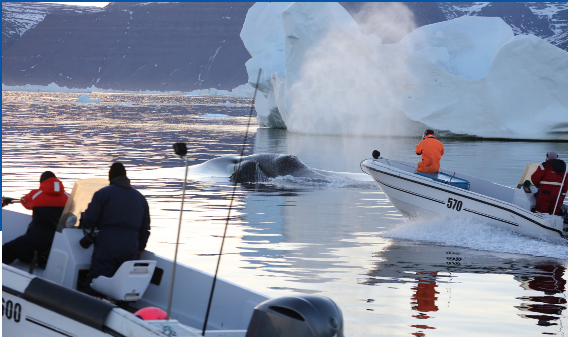
Ilisimatusartartut piniartullu Qeqertarsuarneersut ukiorpassuit ingerlaneranni suleqatigiillutik arfiivit ingerlaartarnerat qulaariartuarsimavaat.