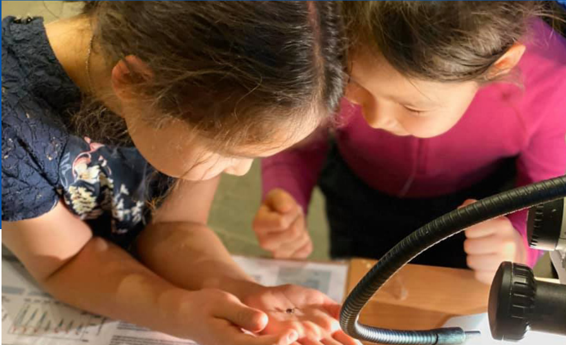
Silap pissusia pillugu ulloqartitsinermi meeqqat sullinernik misissuisut.

ilisimatuussutsikkut misissuinerinik ingerlatsissutigisartakkatsinnik, Pinngortitaleriffiup nutaamik avataani aalisakkanik misissuissutigisartagassaanic umiarsuarmik sanaartornerup naammassinissaata tungaanut, attartorneqartartunik atorluni ukiu-moortumik aalisakkanik raajanillu misissuisarnerit ingerlanneqartarput. Aalisarnernit nalunaarsuutinit uuttortaa-sarnernillu paasissutissat misissuisarnitsinnit paasissutissaatitsinnik ilallugit ukiumut suliassat aalajangersimalluinnartut sularineqartarput: aalisarnernit nalunaarsuutit misissoqqissaarneqarnerat, misissueqqinnissat piareersarneqarnerat ingerlanneqartarnerallu, nalunaaqtsersuinerit, siunnannik misissuinerit, aalisagaqatigiiaanilu utoqqaassuseqatigiiaat katitigaanerisa misissuiffignerat pisarput.