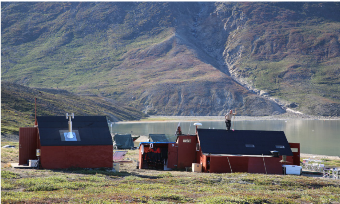
Ittoqqormiit eqqaani Hjørnedalimi illuut.